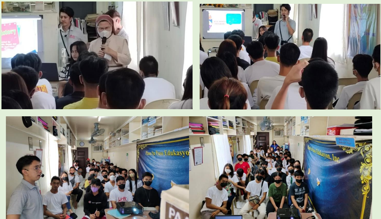
Parola Center General Orientation