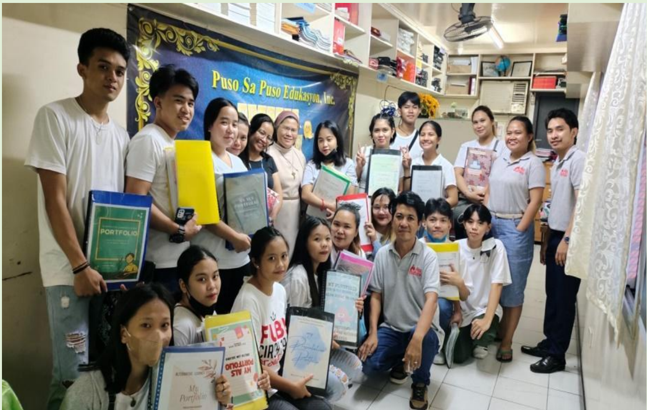
The Successful Parola Passers of Presentation of Portfolio Assessment 2022.