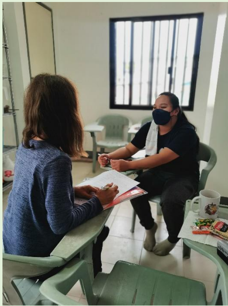
Interview with a learner