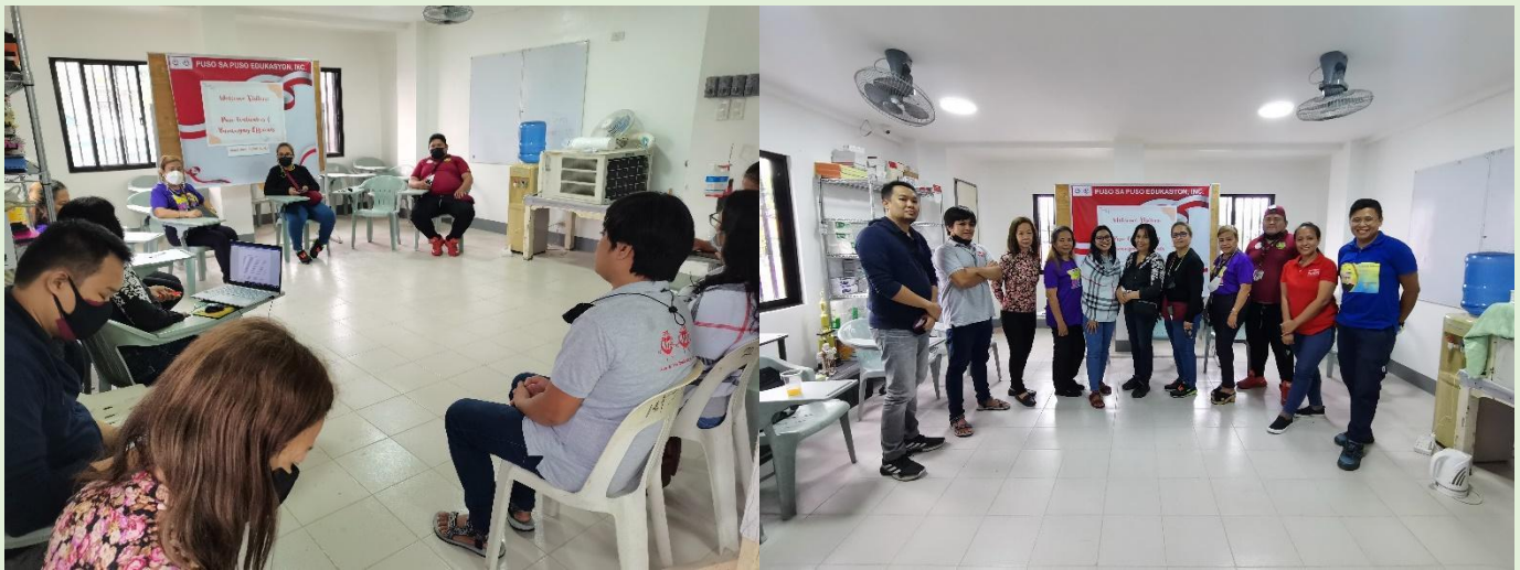
LGU representatives in Payatas