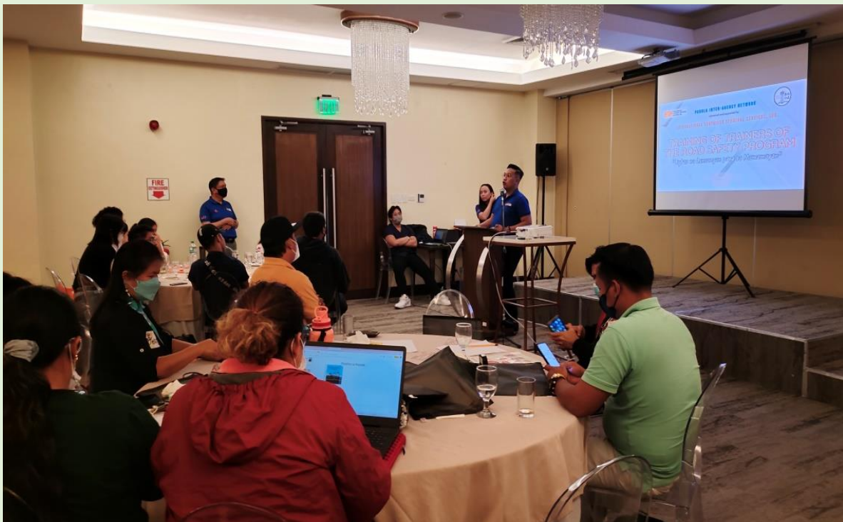
First day of Training in Tagaytay City together with PIAN Partners.