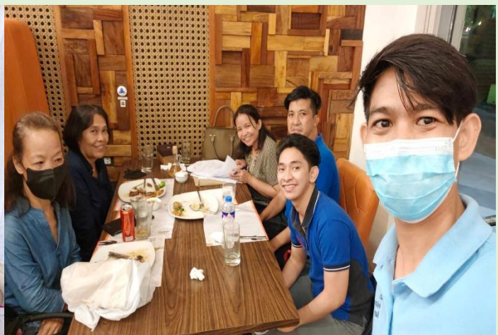
Discussion with DepEd representatives from Manila