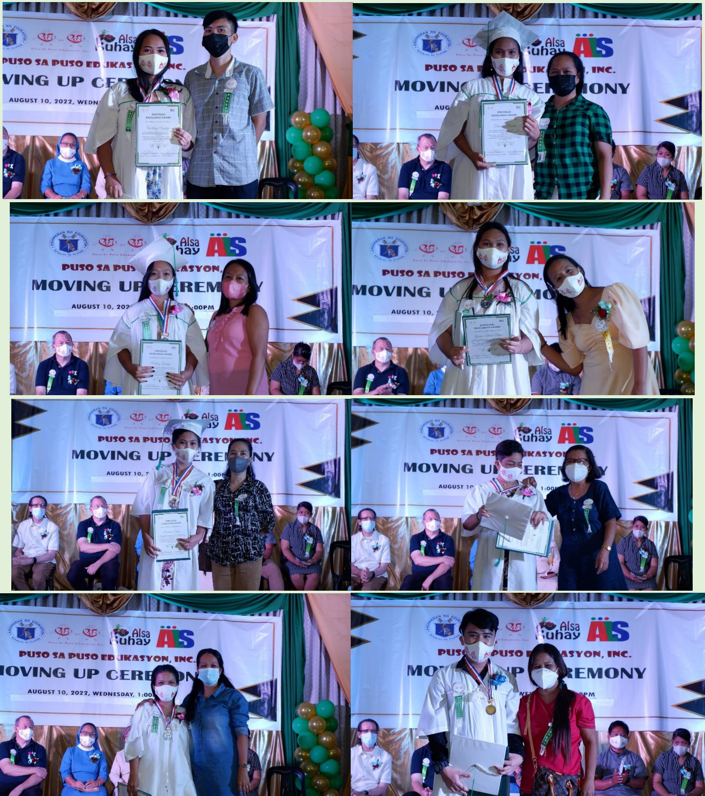
Payatas and Parola Excellence Awardees