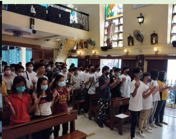
Parola Center Opening Mass