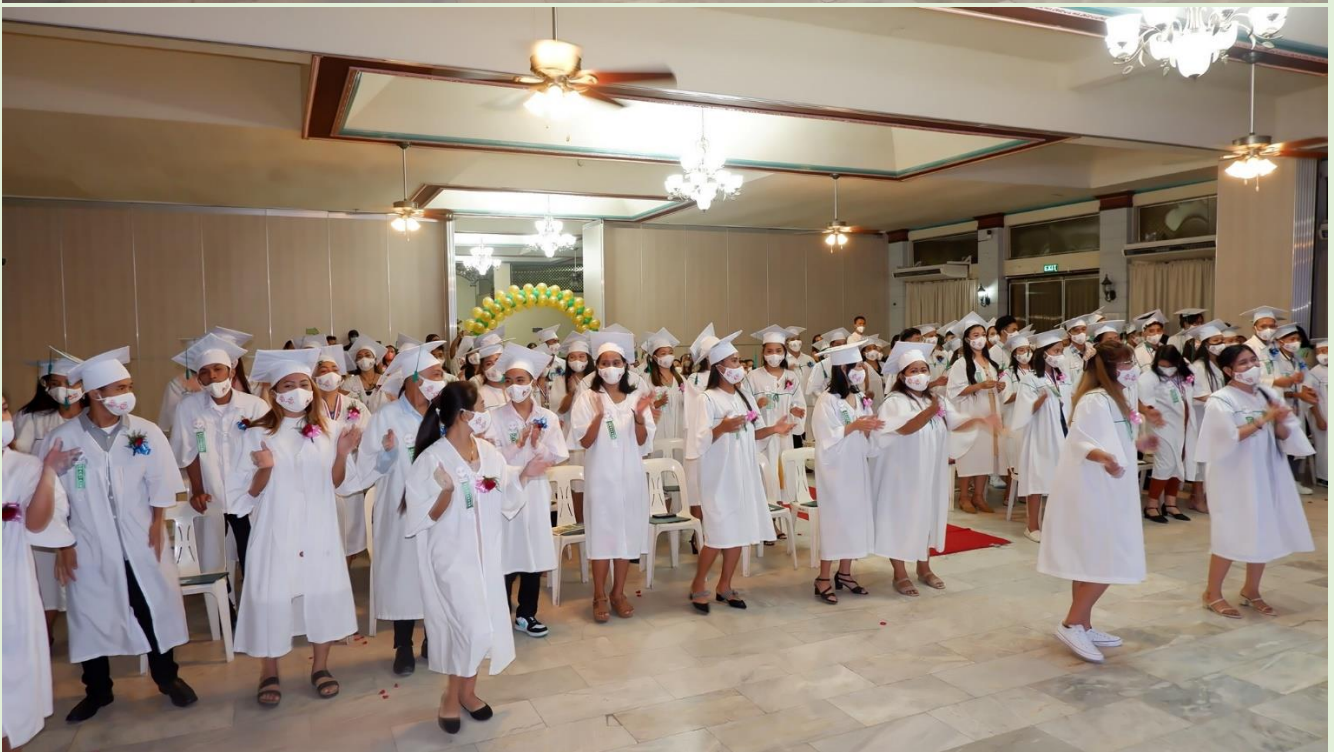
Graduates and completers dance performance