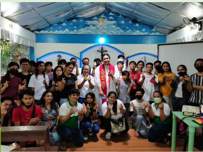
Payatas Center Opening Mass