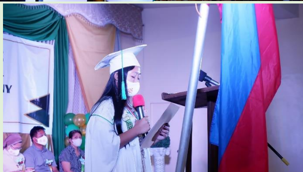
Guests and speakers