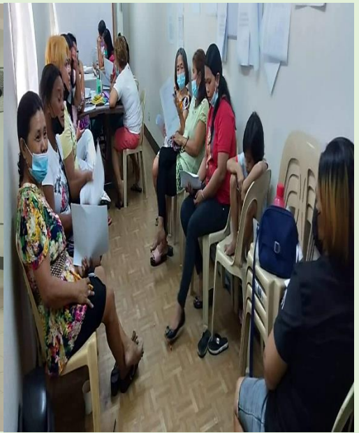
Parola Parents waiting their turn for interview