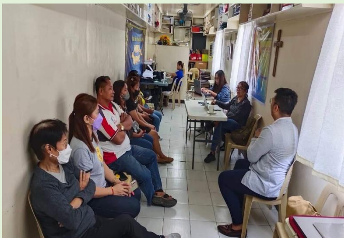
FGD for LGU and PIAN representatives in Parola