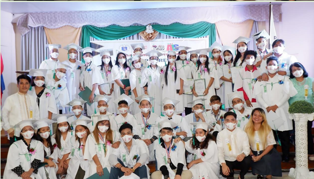
Parola and Payatas graduates and completers