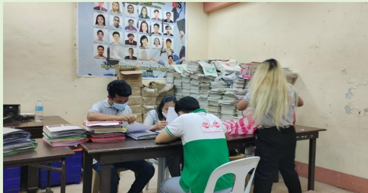
District Revalidation at Cecillo Apostol Elemetary School