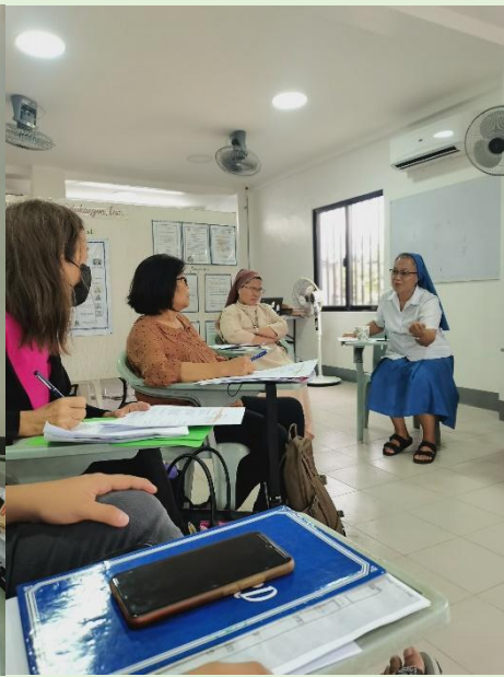
FGD with the staff and admin