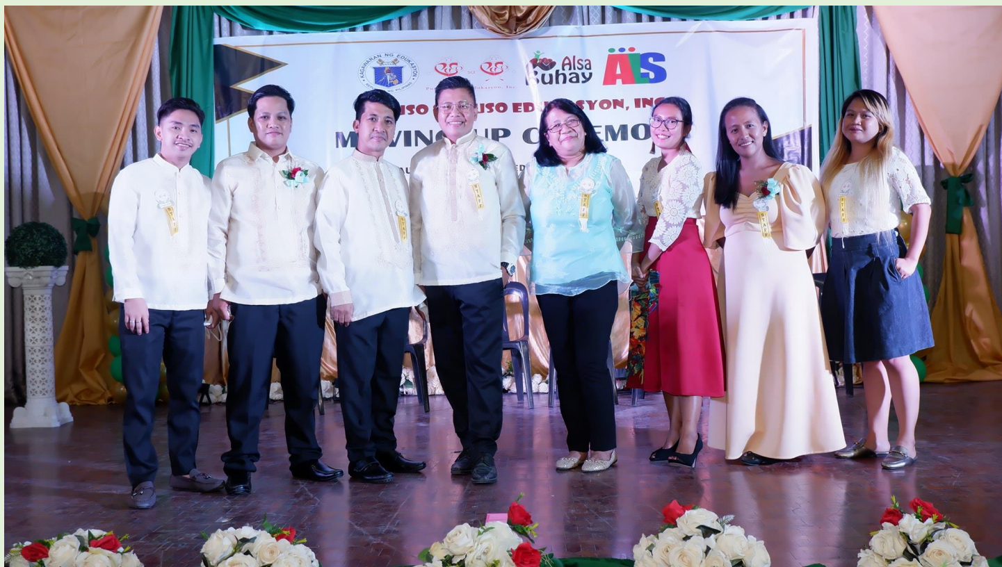
Instructional Managers, Livelihood Coordinator, and Social Workers