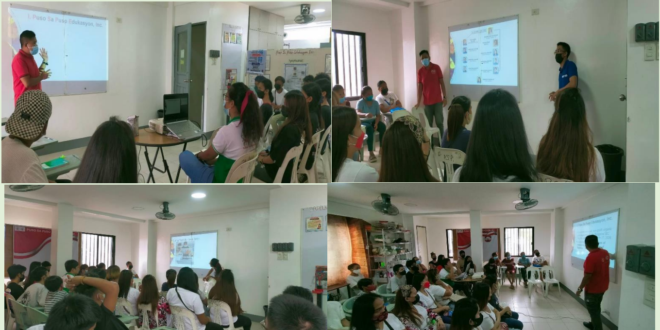
Payatas Center General Orientation