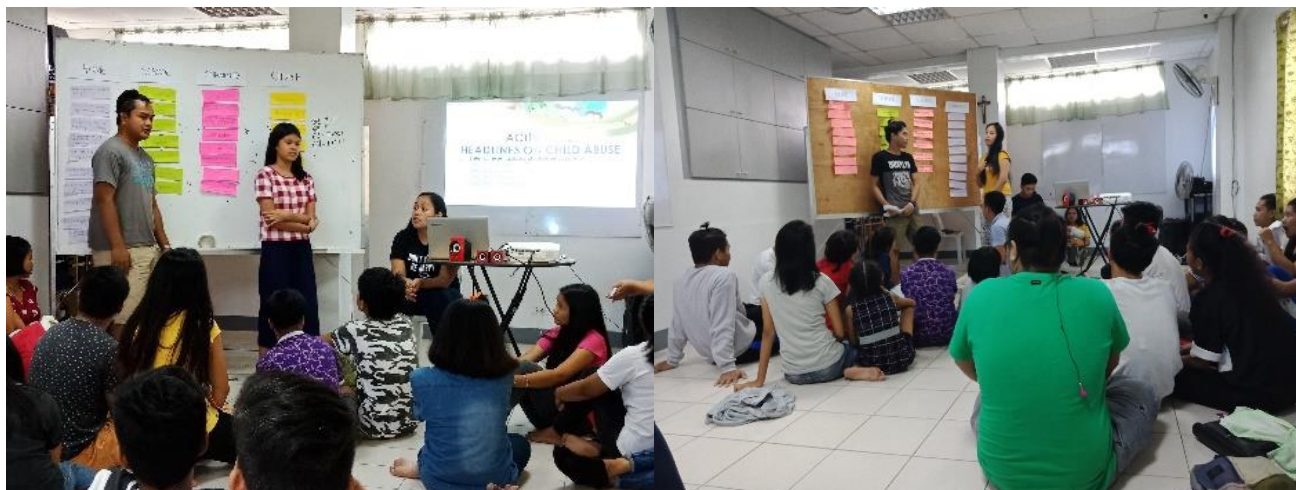
Learners' output: Headline on Child Abuse