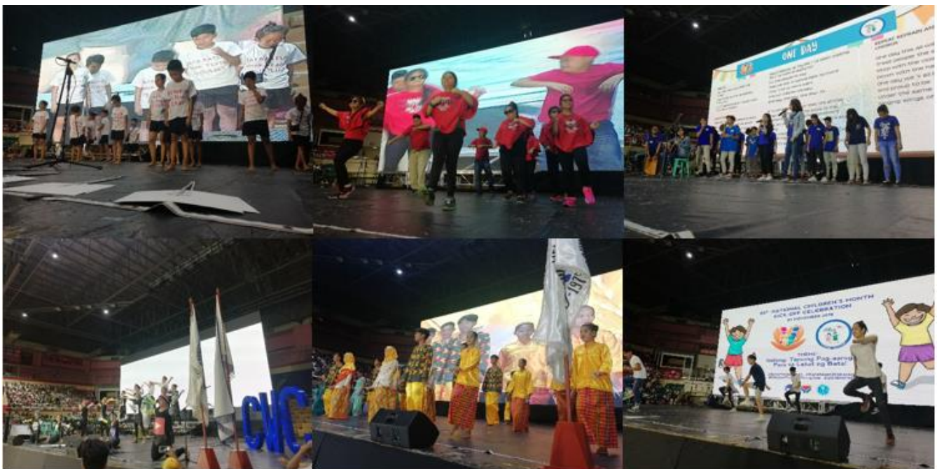
Performances from different groups including the Payatas and Parola learners