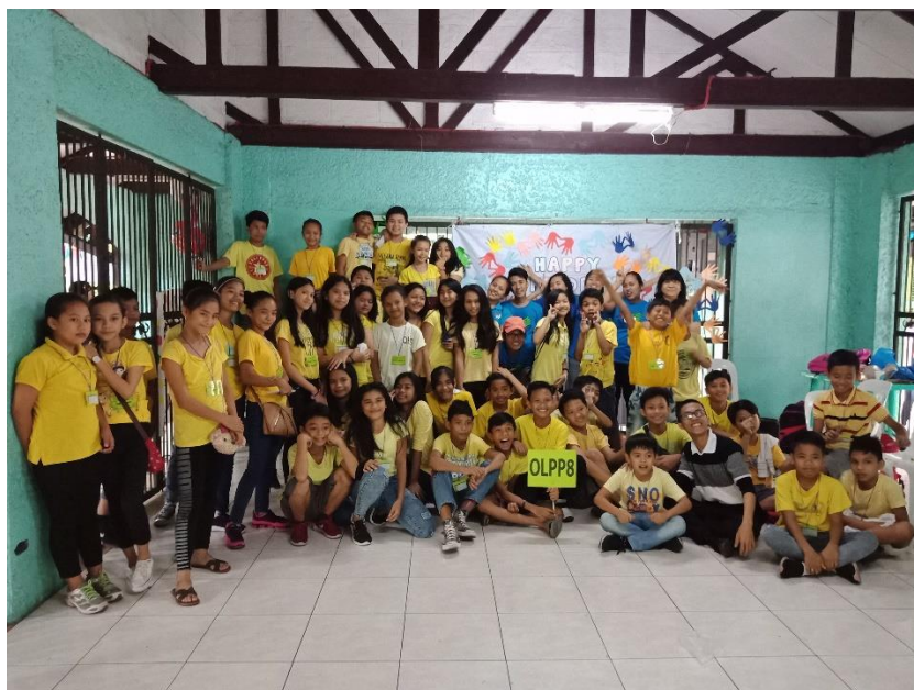
Group photo with the kids