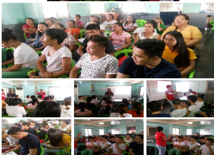
Highlights on Financial Education Seminar