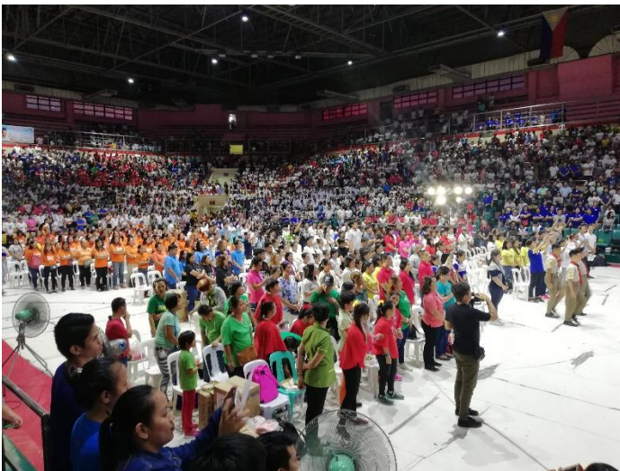
Other participants of the event