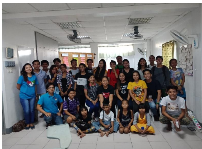
Group photo: BLP learners and Secondary B