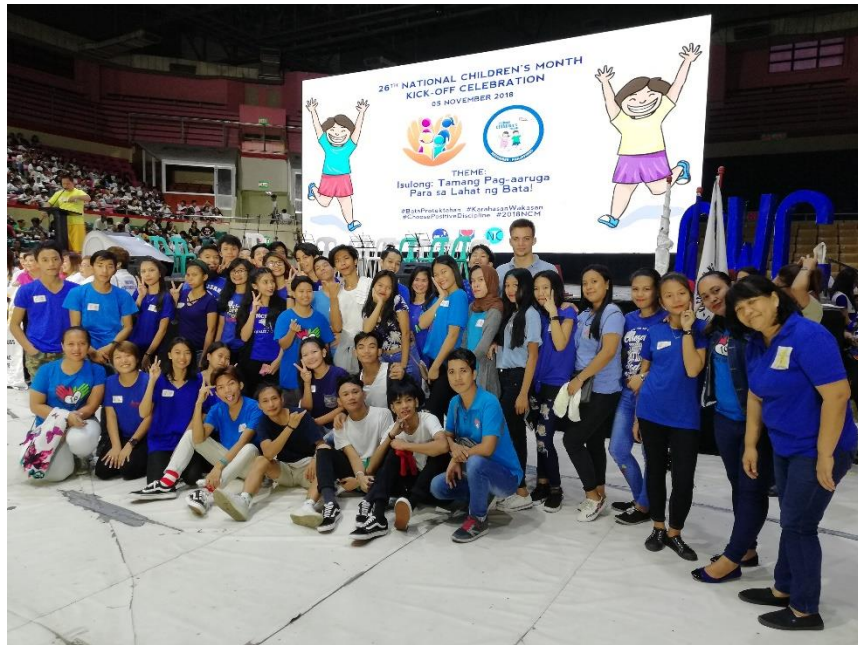
Attendees from Puso Sa Puso including the staff and selected learners