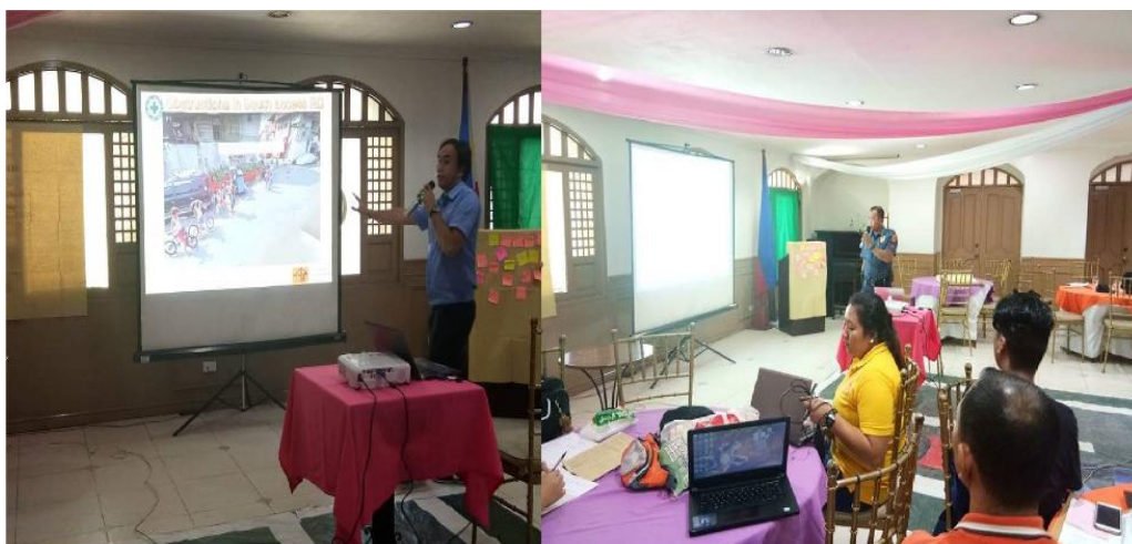
Group Presentation of Road Safety Modules for the Communities of Parola Tondo, Manila