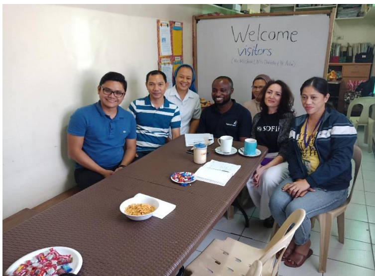
Group photo with partner agencies