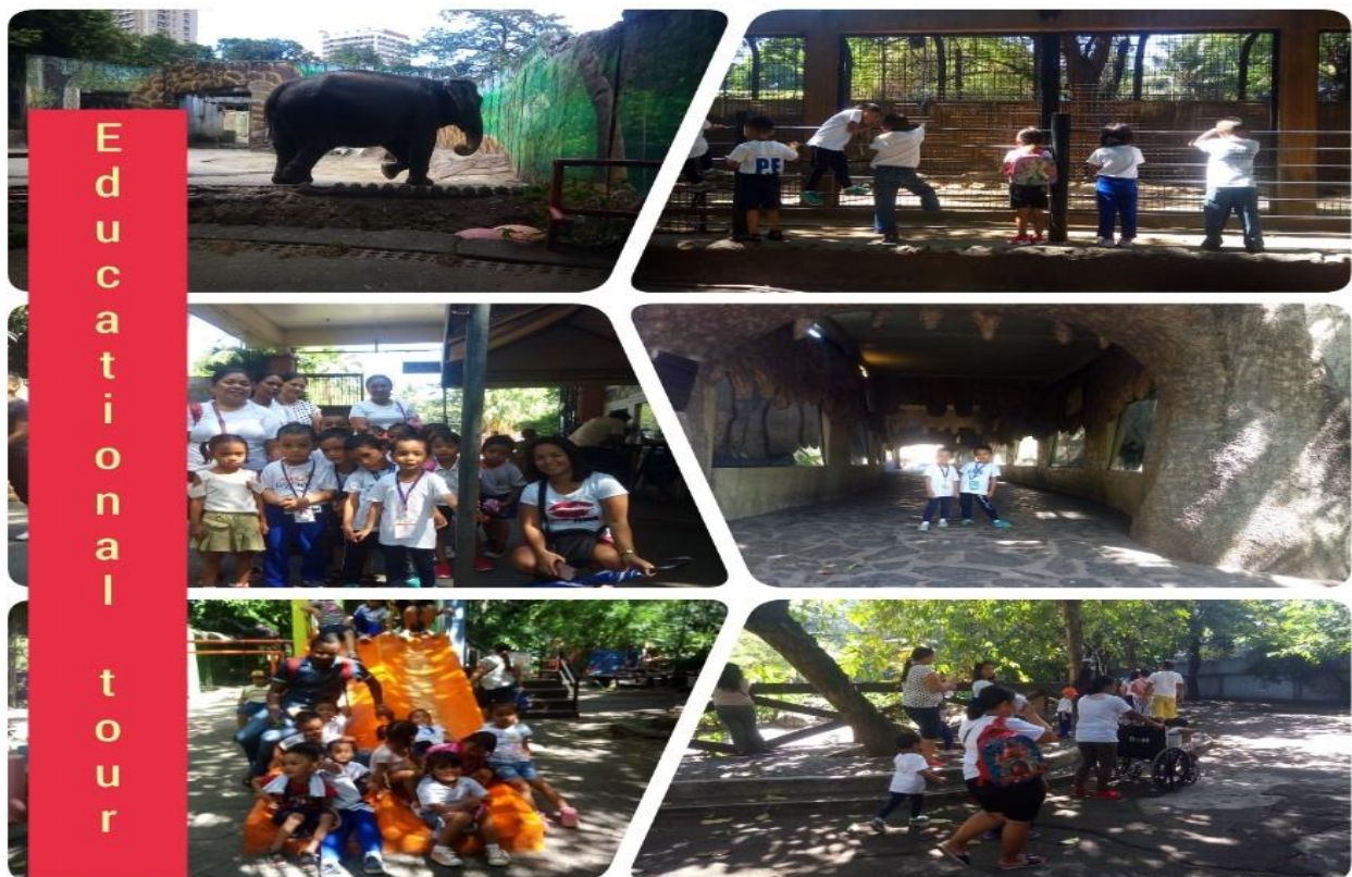
Random photos at Manila Zoo