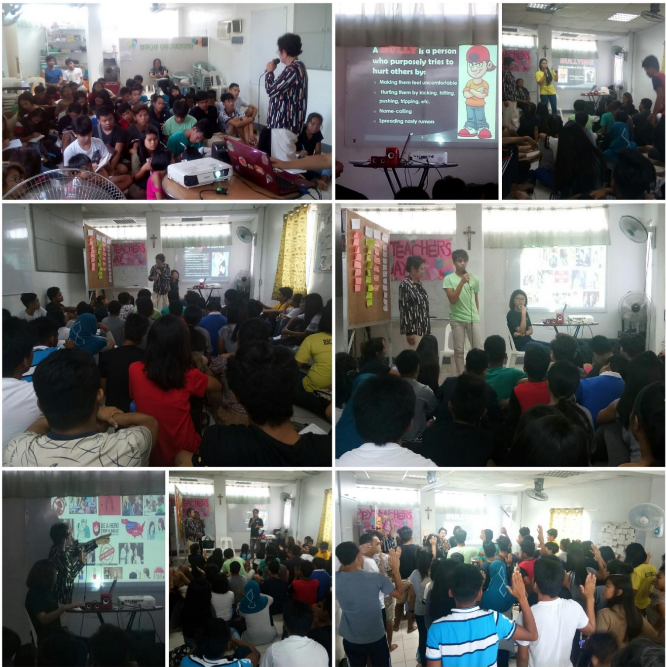
Highlights of the event with the participants and the speakers