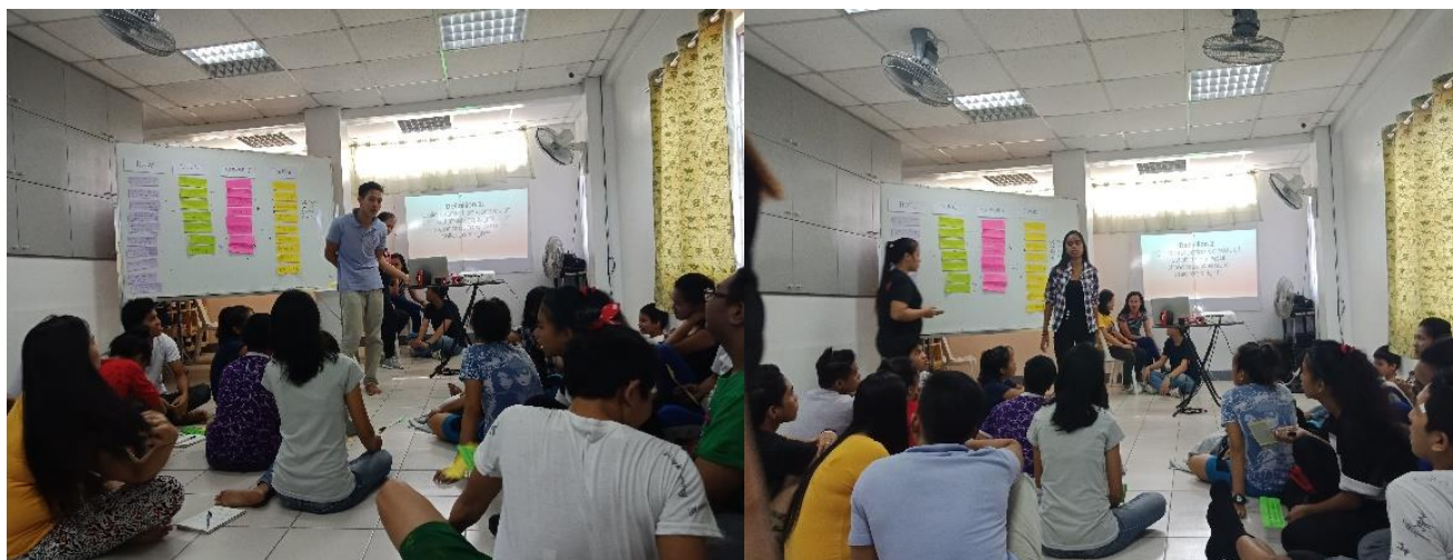
Learners' insight about Child Protection