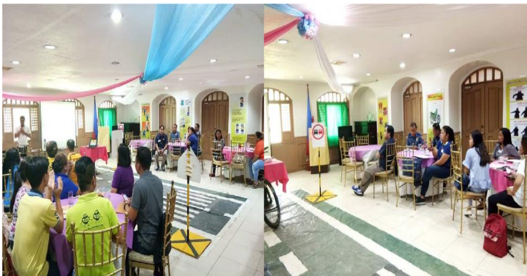
The participants in the training