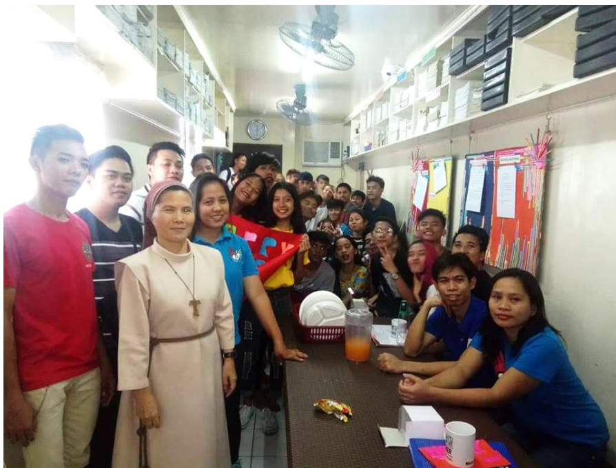
Group photo in Parola after the event