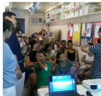
Group picture and highlights on breastfeeding awareness session (Parola)