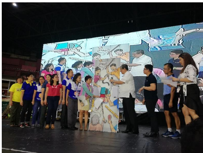
Presentation of Symbolic Pledge of Commitment (signature campaign for the passage of Positive Discipline Bill facilitated by NCM Lead Agencies