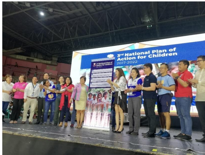
Launching and presentation of 3 rd National Plan of Action for Children facilitated by various organization