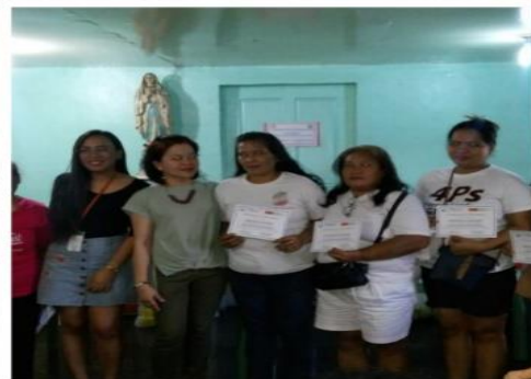
Receiving of Certificate of Appreciation