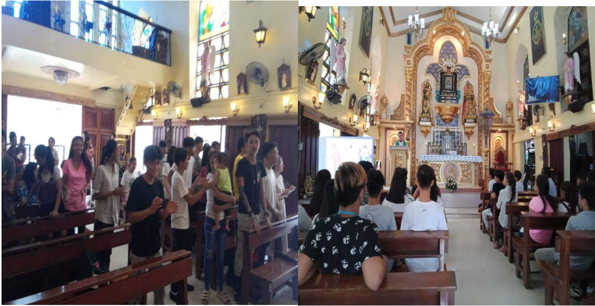
The attendees in the Eucharistic celebrations