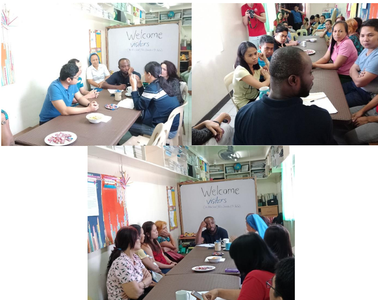
Group interview with the partner agencies, scholars, previous and current learners