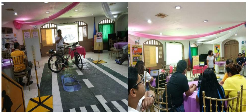
Pilipinas Shell Foundation Inc. Demonstrated of Road Safety using bicycle.