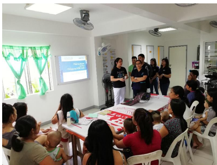
Payatas session on breastfeeding