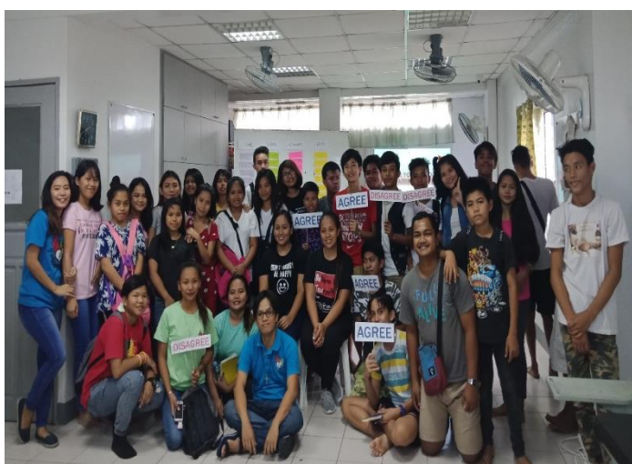
Group photo: Elementary and Secondary A