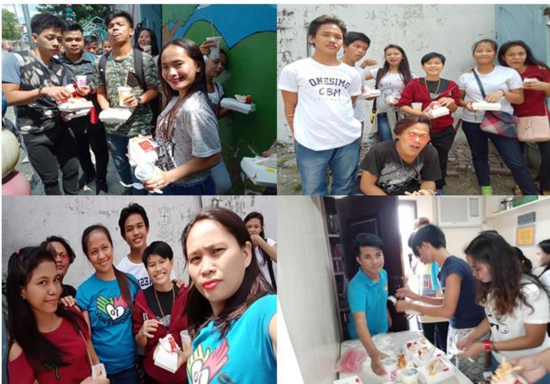
Distribution of lunch meal (McDonalds) which is being sponsored by one of the donors of Puso Sa Puso