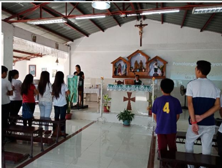
Readers in the mass