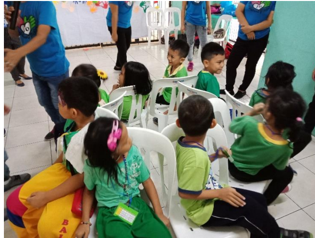
Group games: yellow team – calamansi relay, blue team – paper relay and green team – musical chair