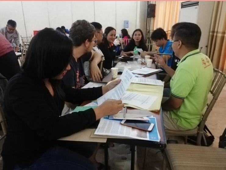
Staff of Puso Sa Puso in action during the workshop