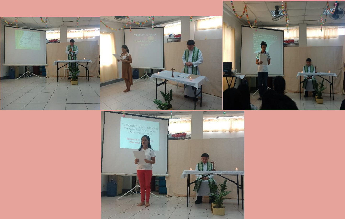
Payatas center mass