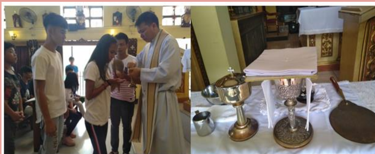
Liturgy of the Eucharist