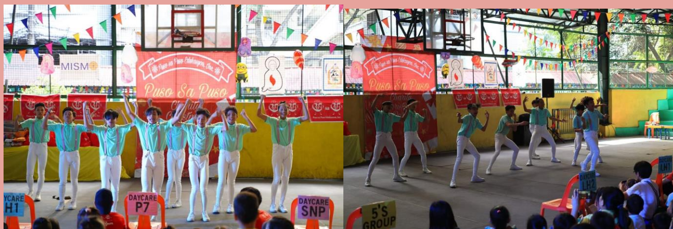
Steps of Gold Dancers