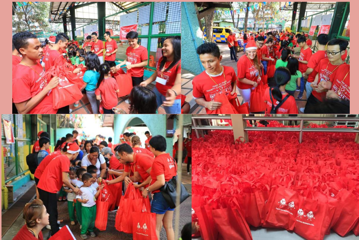
Yey! Gift giving! ☺