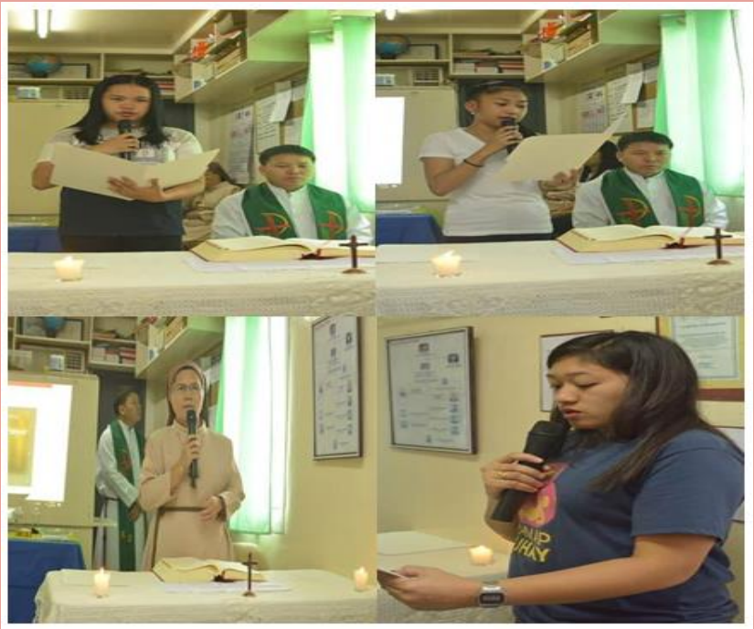
Parola center mass