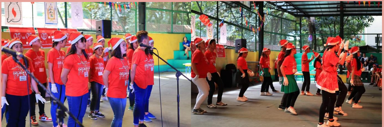
Parola and Payatas learners performed a song and dance presentation!