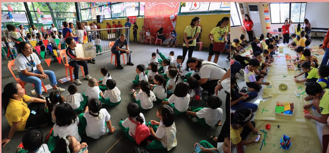
Different games and activities for the kids!