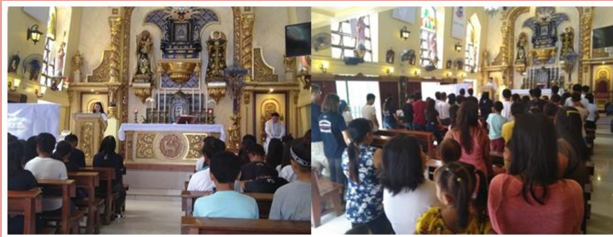
Liturgy of the Word