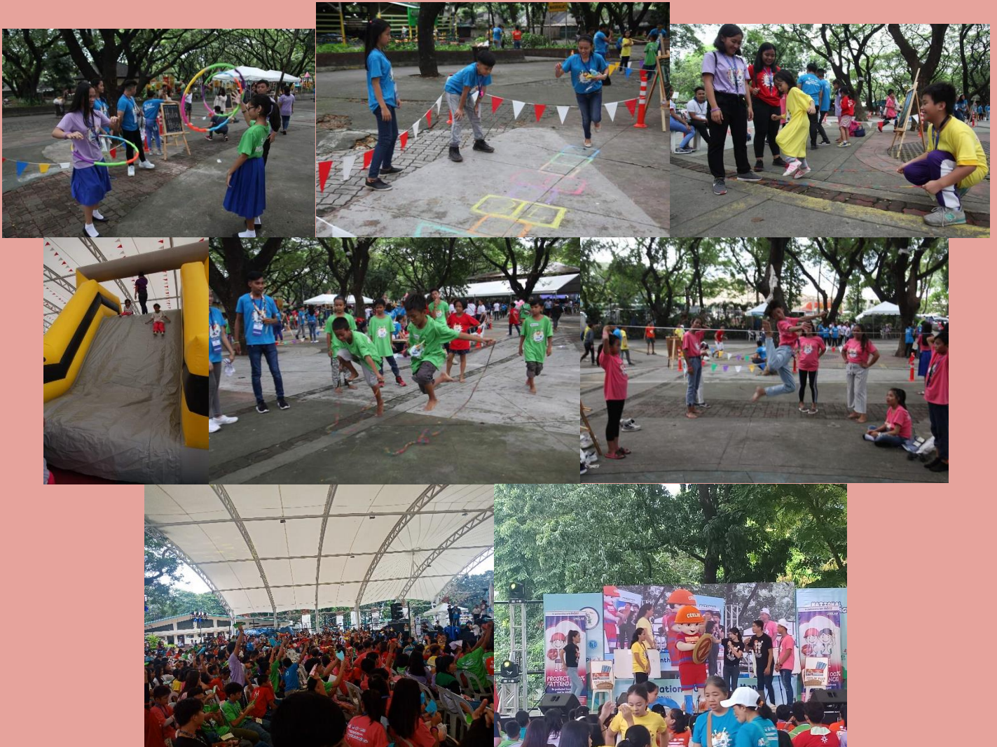
Different games prepared!