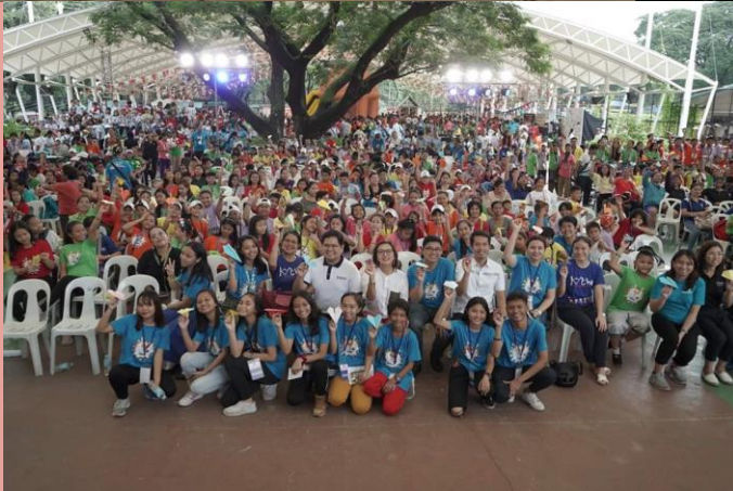
Group photo of Payatas and Parola learners and with the other participants.