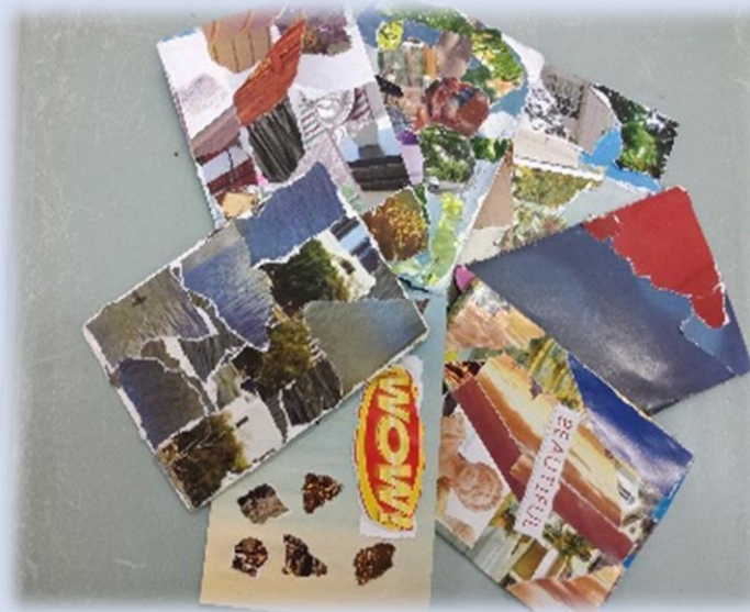
The staff's output