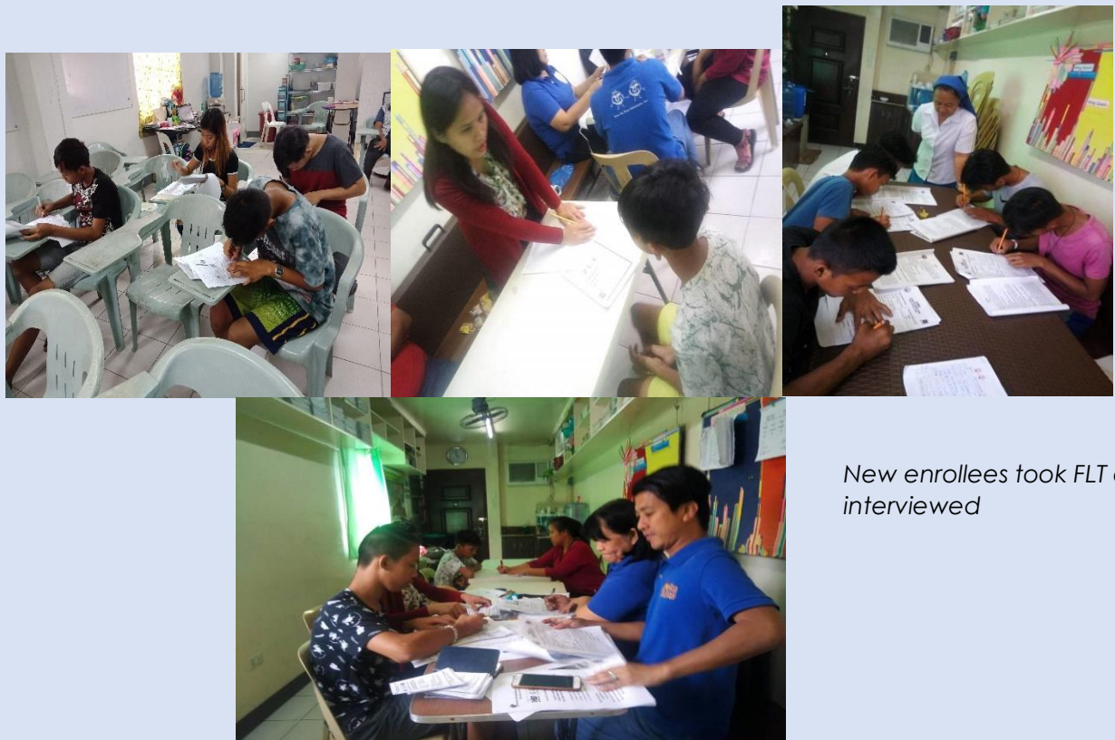
New enrollees took FLT and interviewed