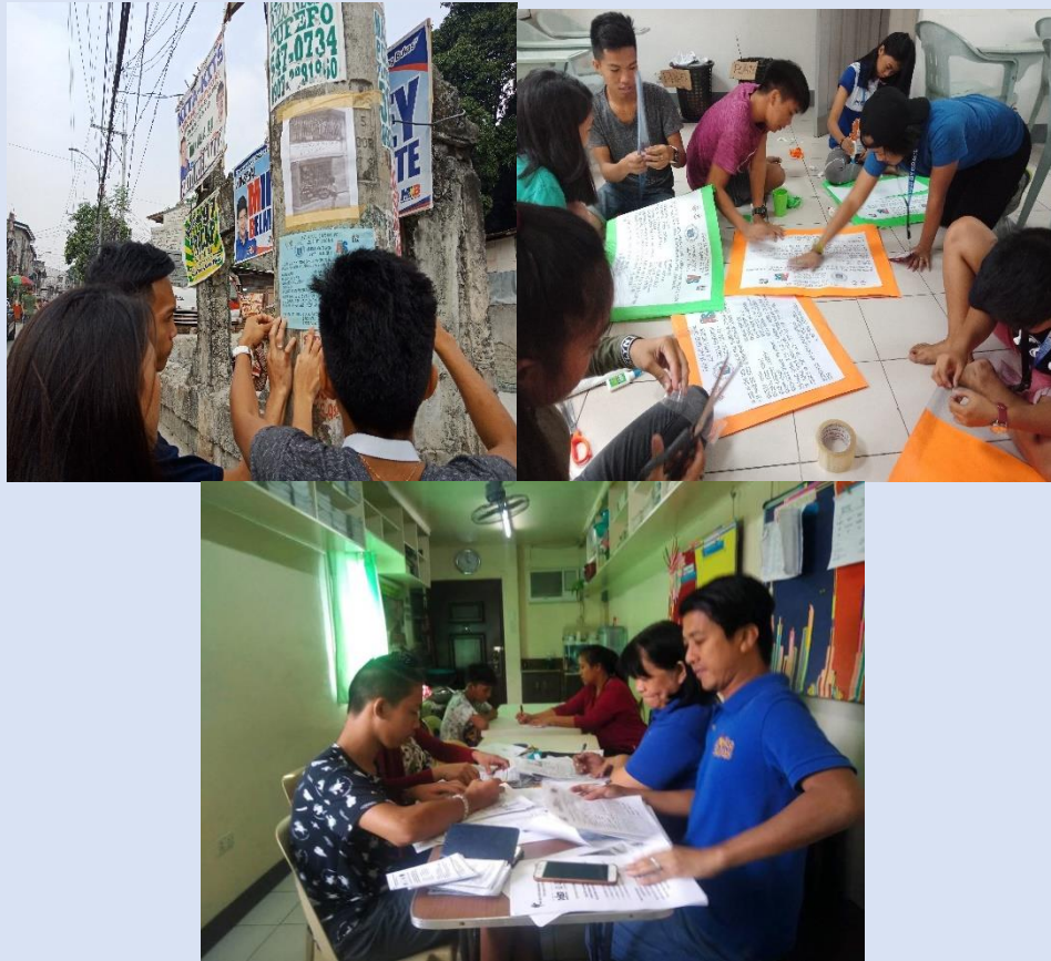
Preparation in the enrollment process