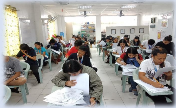
Parola and Payatas learners during their mock test