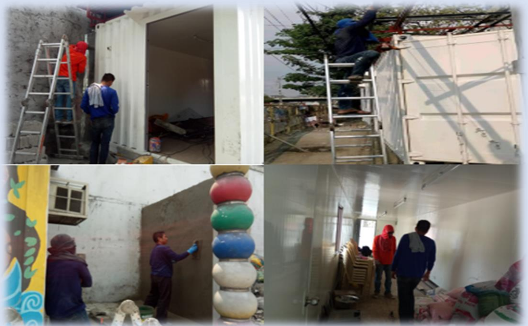
The renovation of the new container van into a conducive learning center