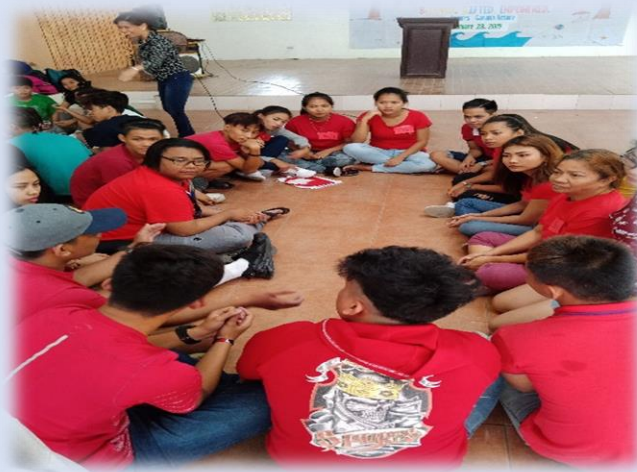
Learners color coded groups