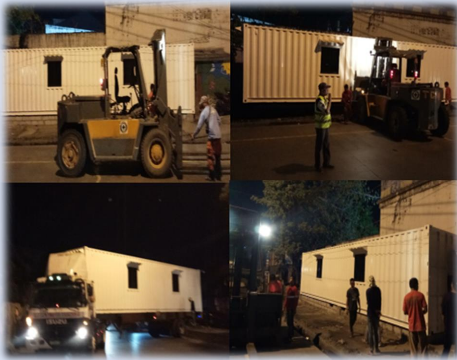
The new container van was delivered in Parola