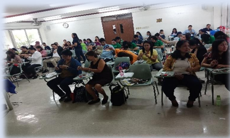
The participants doing their own design of book mark