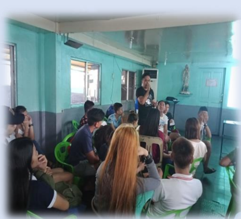
Selected learners reported their experiences as a group