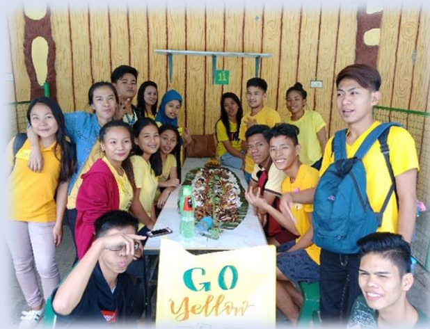
A boodle fight prepared in each team