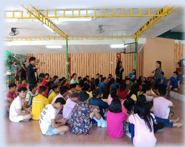
Learners sharing their life's experiences