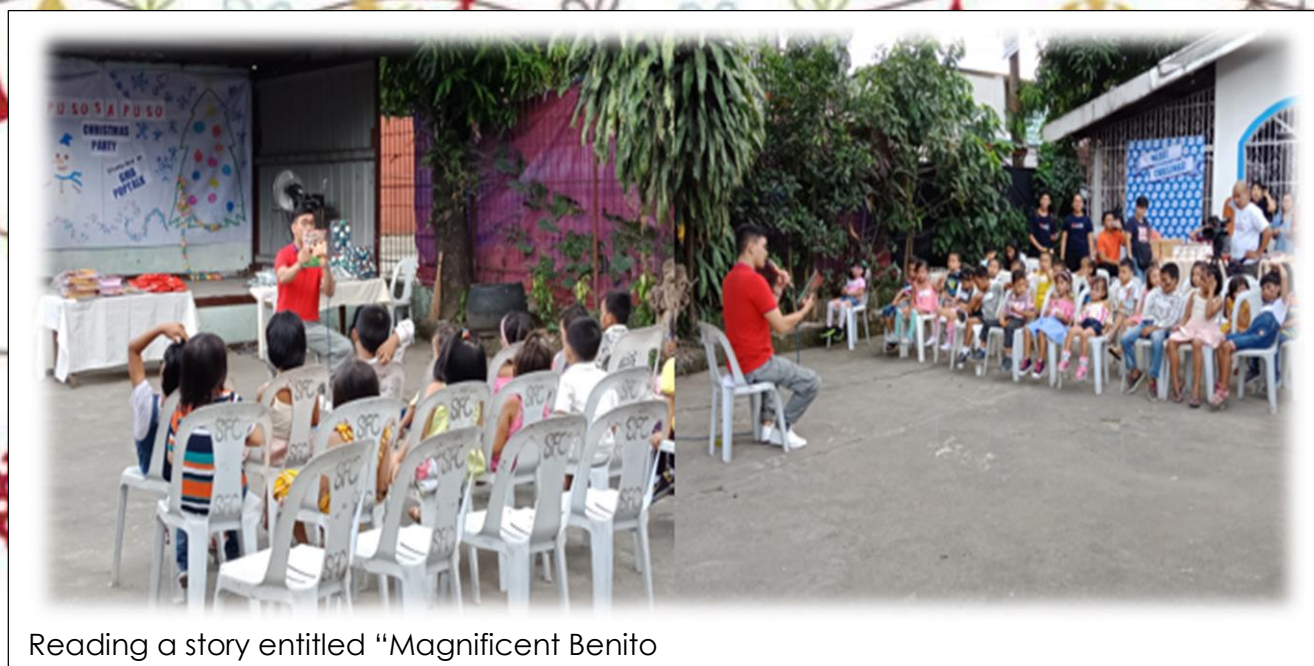
Reading a story entitled "Magnificent Benito"