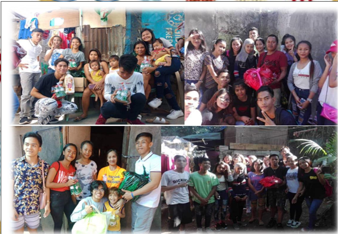
Highlights of Payatas Charity event: gift giving and caroling