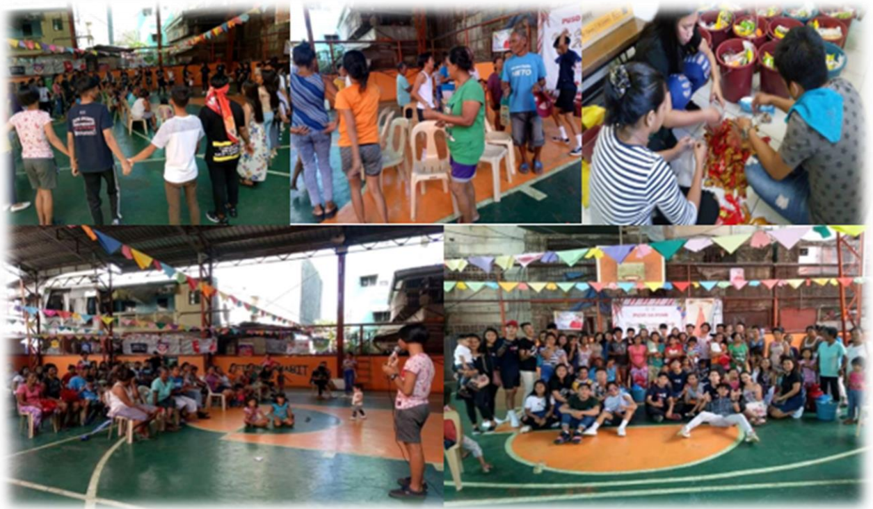
Highlights of Parola Charity event: Different fun games and presentations