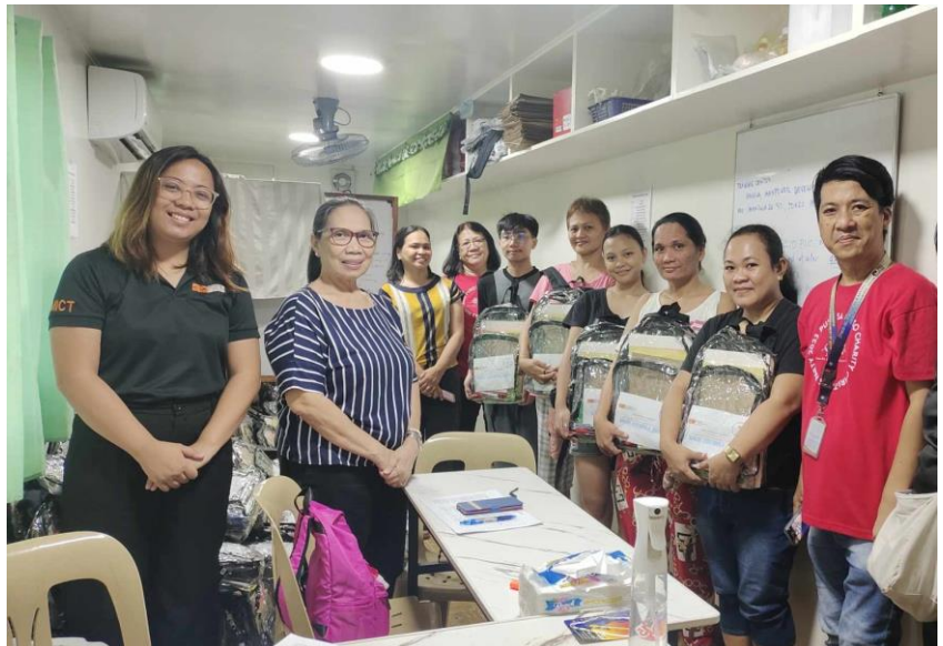
Photos taken at Puso Sa Puso Edukasyon, Inc- Parola Center