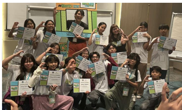
Captured during and After the event.