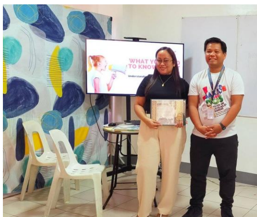
Photos taken at Puso Sa Puso Edukasyon, Inc- Payatas Center