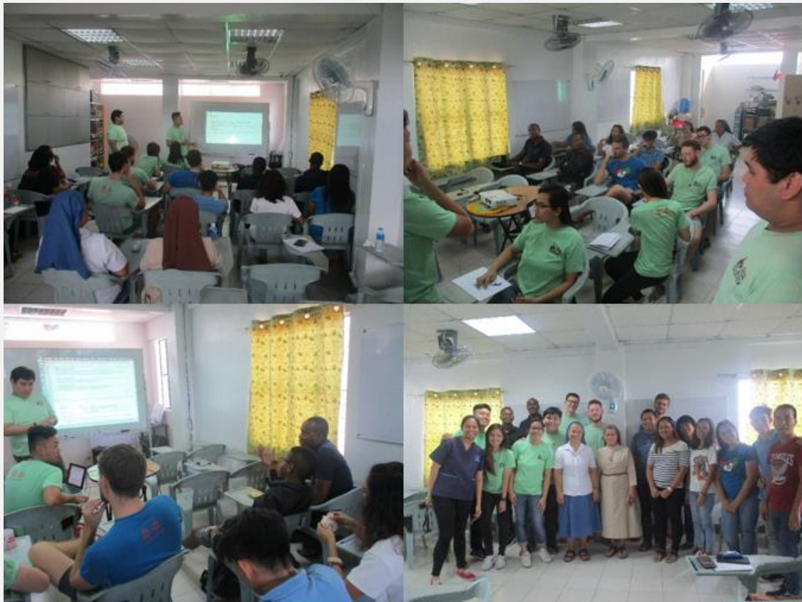
Orientation of the staff and volunteers facilitated by Ateneo medical students