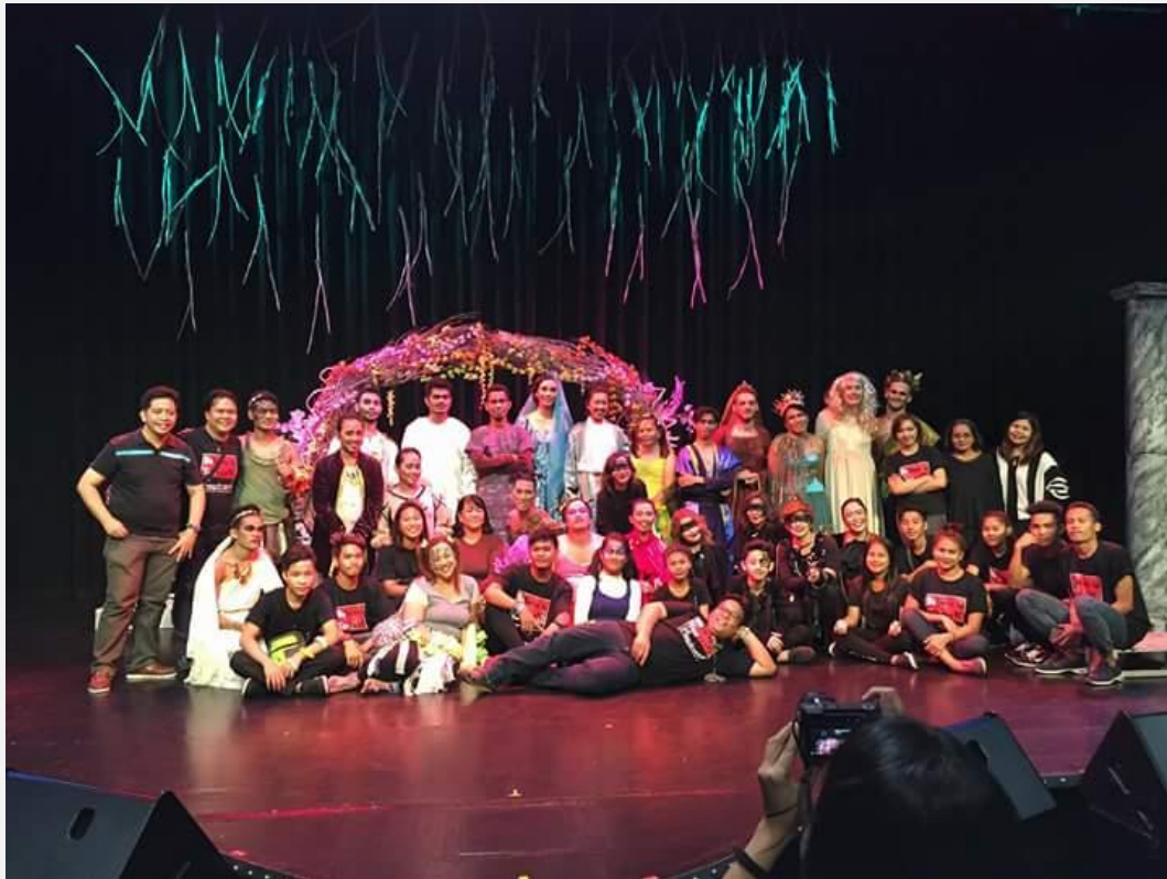
Full casts and crews after the successful run in the Music Museum