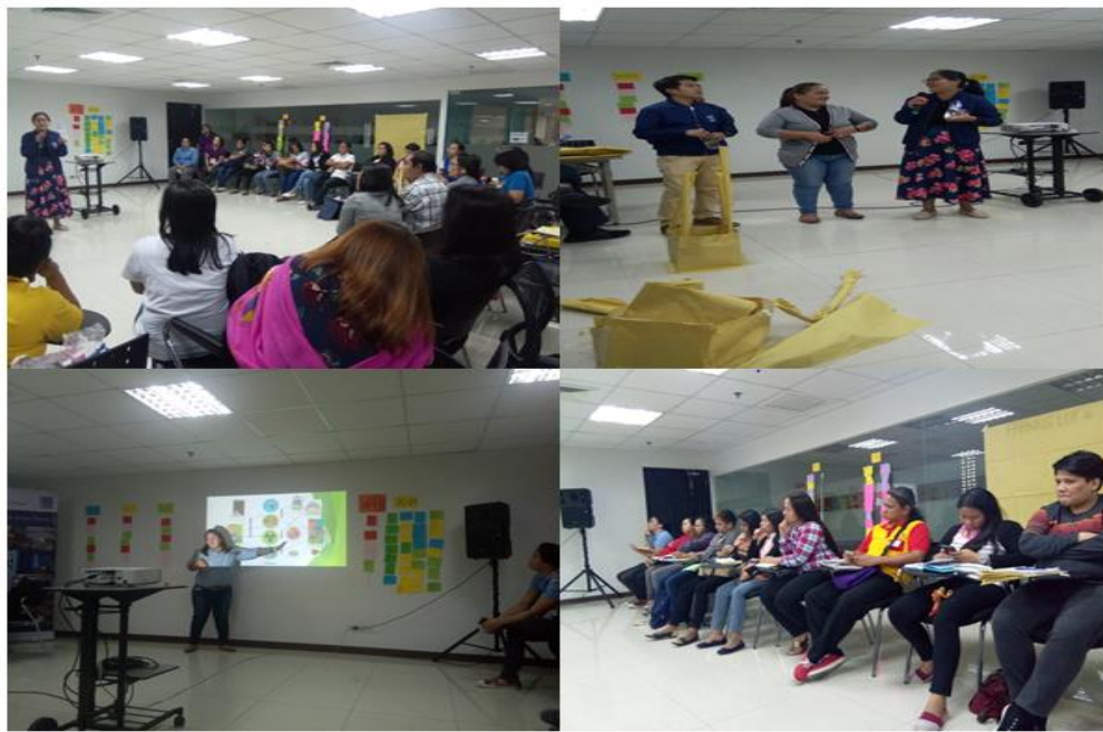
Seminar proper: discussion, activities, open forum