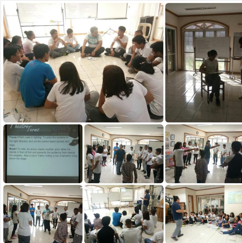
Discussion on Fundamentals of production and Stage Management, sequencing of actions, short role playing activity