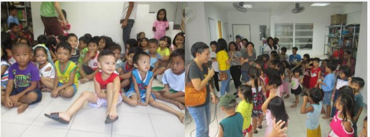
Kids enjoying the program and games prepared by the students and their respective parents