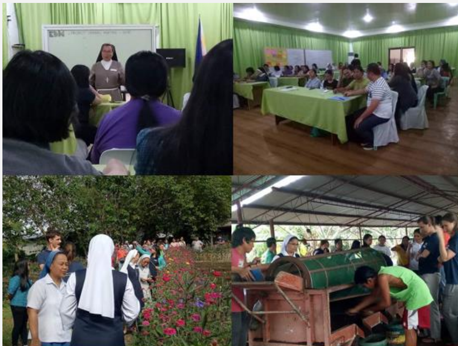
Meeting proper and presentation. Participants also had the chance to sightsee the organic farm