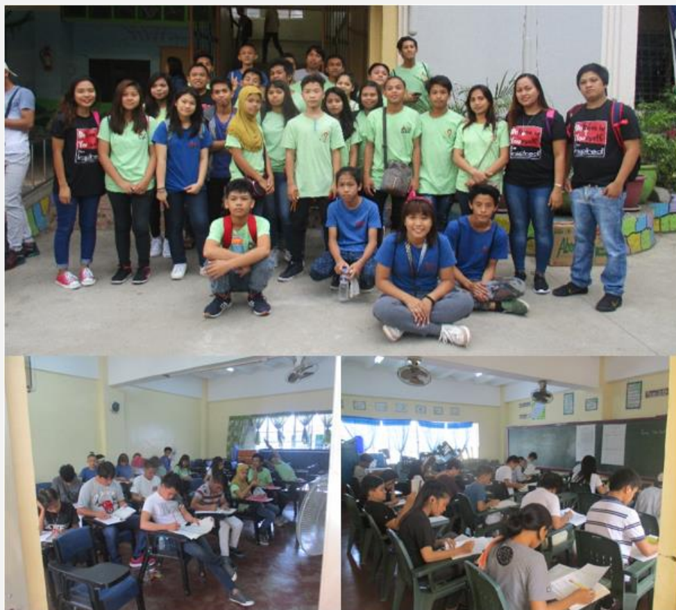
Payatas learners with their Instructional Managers and social worker