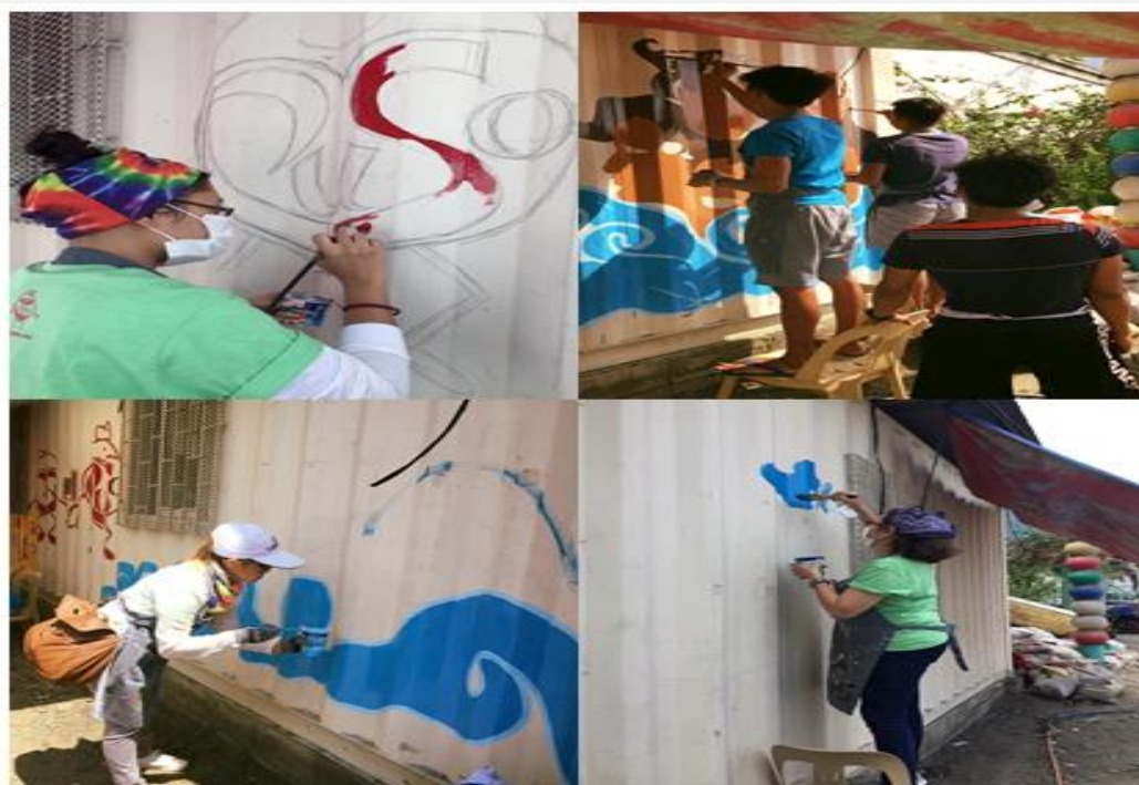
Painting, decorating, and designing by generous sponsors and artists