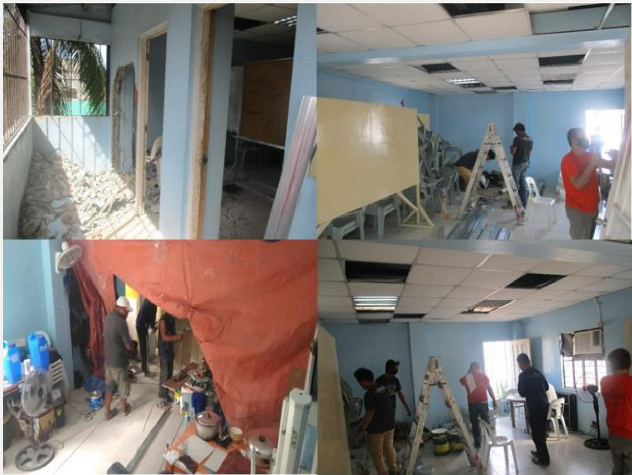
During the initial phase of renovation