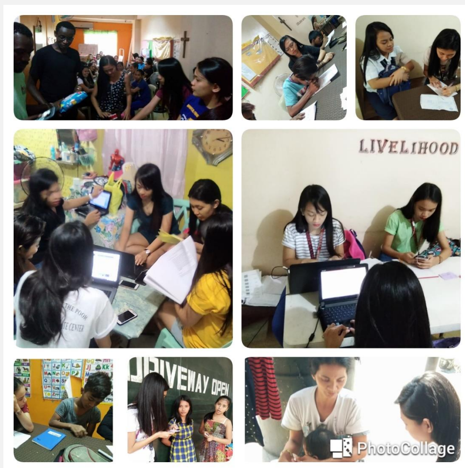
These random photos were taken throughout their field exposure in Puso Sa Puso Edukasyon Inc. (Parola center).