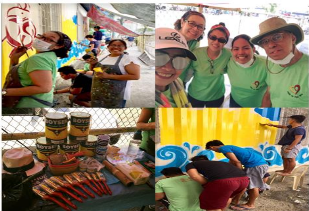
Some of the accomplishment of the team