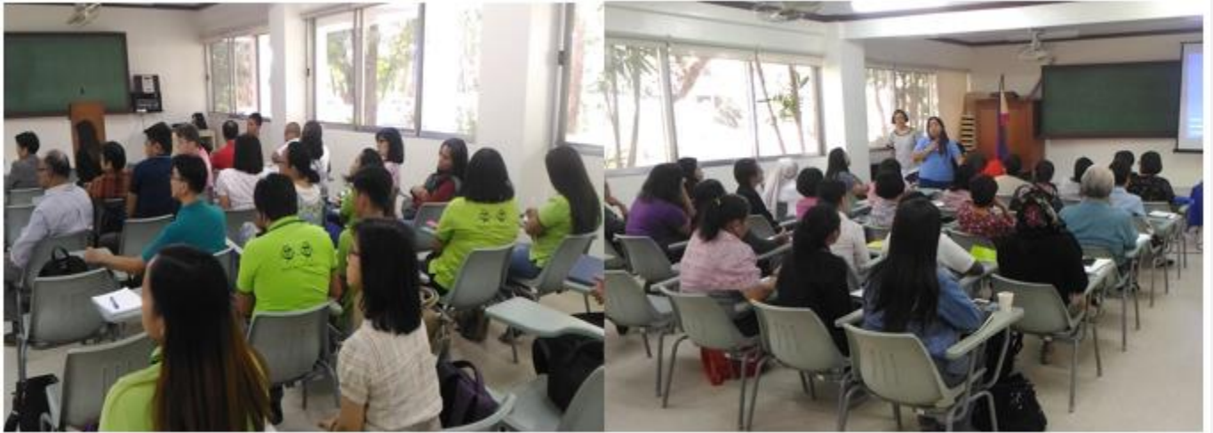
Different organizations from both government and non-government attending the meeting