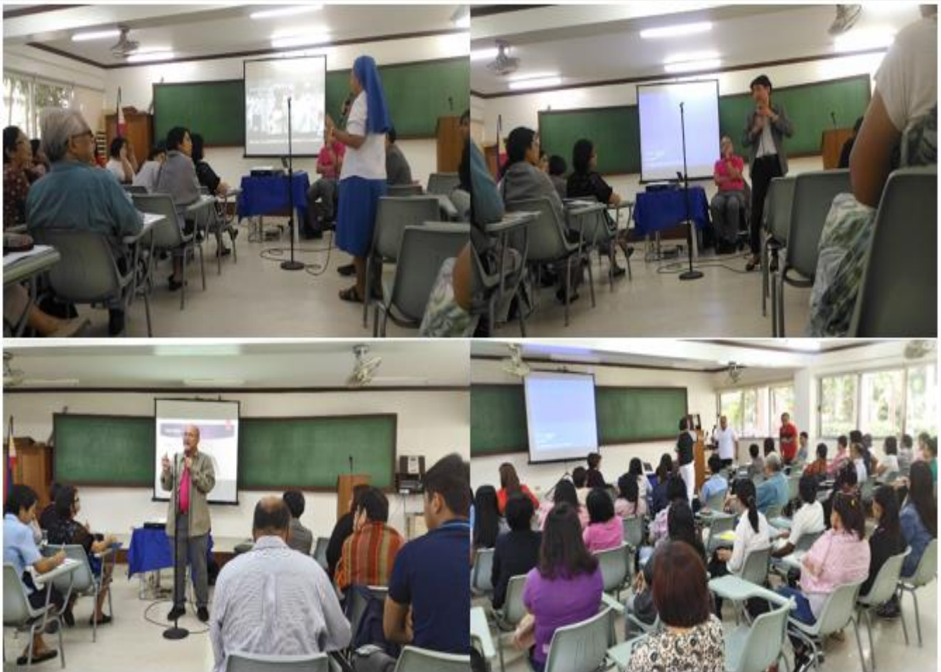
Sharing of expertise, experiences, and insights about the topic