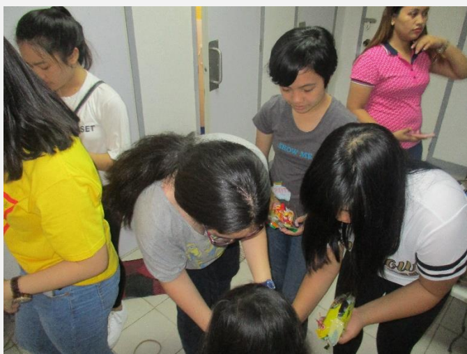
Students giving their gifts to the kids