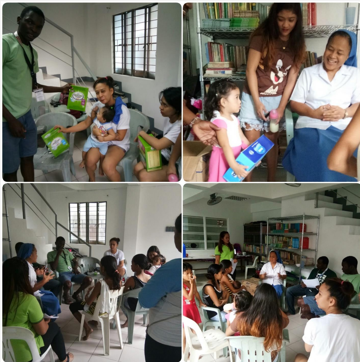
Actual distribution of milk formula and short discussion about the project