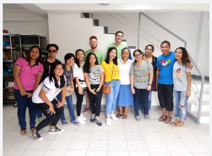
Group photo with the Payatas staff