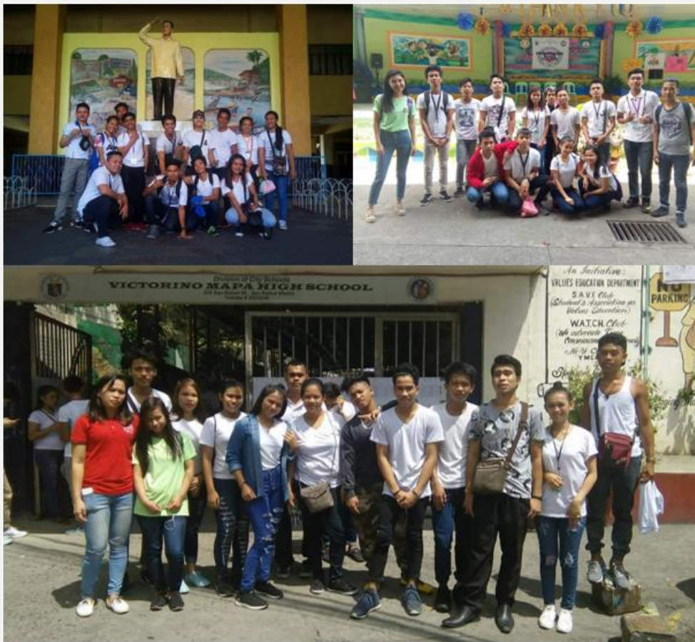
Parola learners with their Instructional Managers and social worker