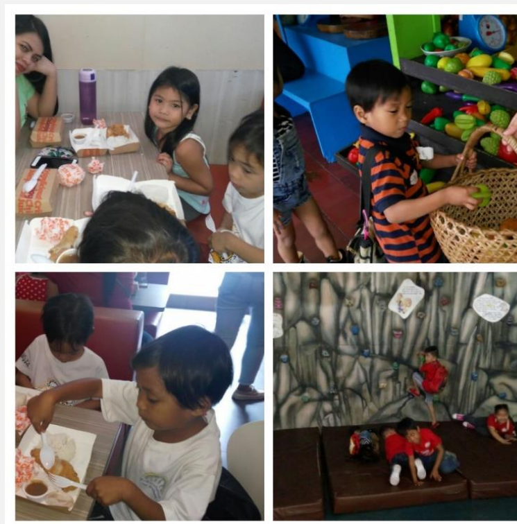
Lunch time at Jollibee. Kids also enjoyed the mini wall climbing and marketing.