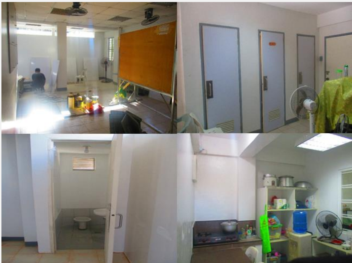
Improved areas for finishing