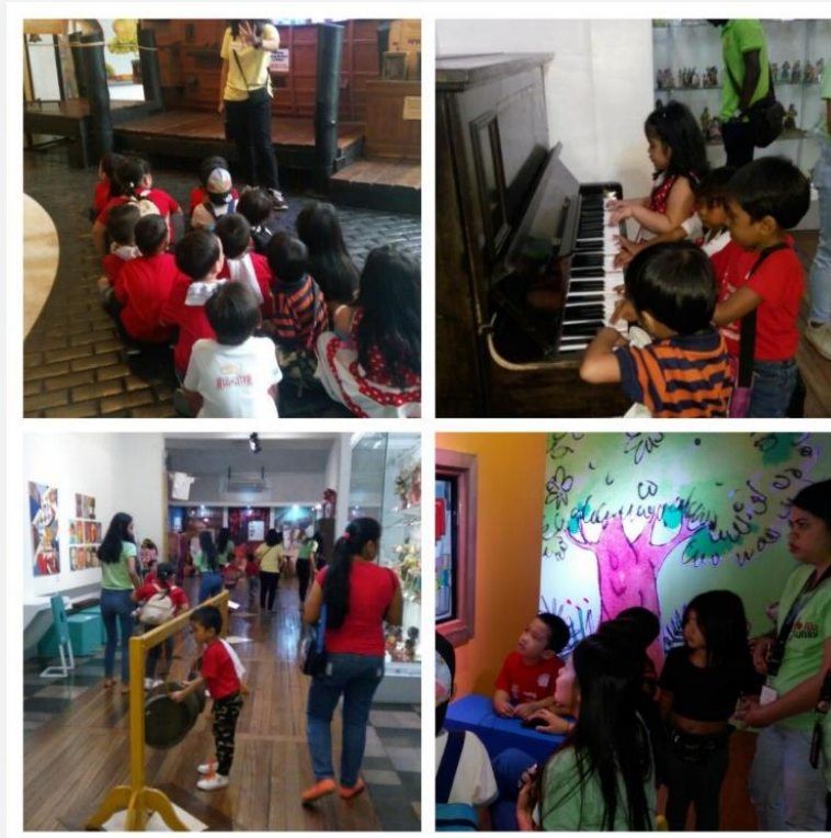
Kids enjoying all the activities in Museo Pambata