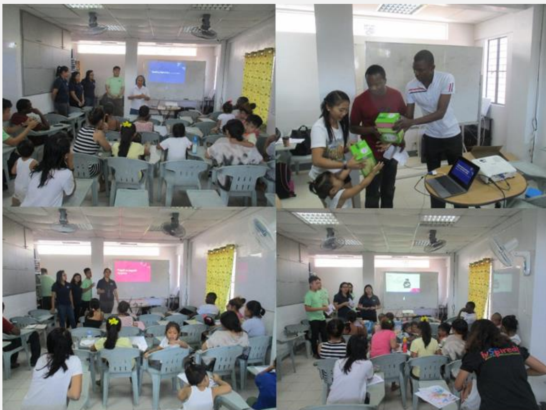
Actual launching of MCHN Program in Payatas with milk distribution