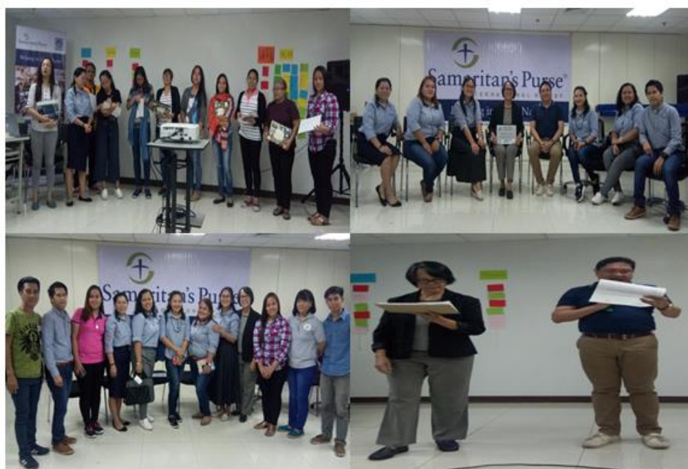
Awarding of certificates