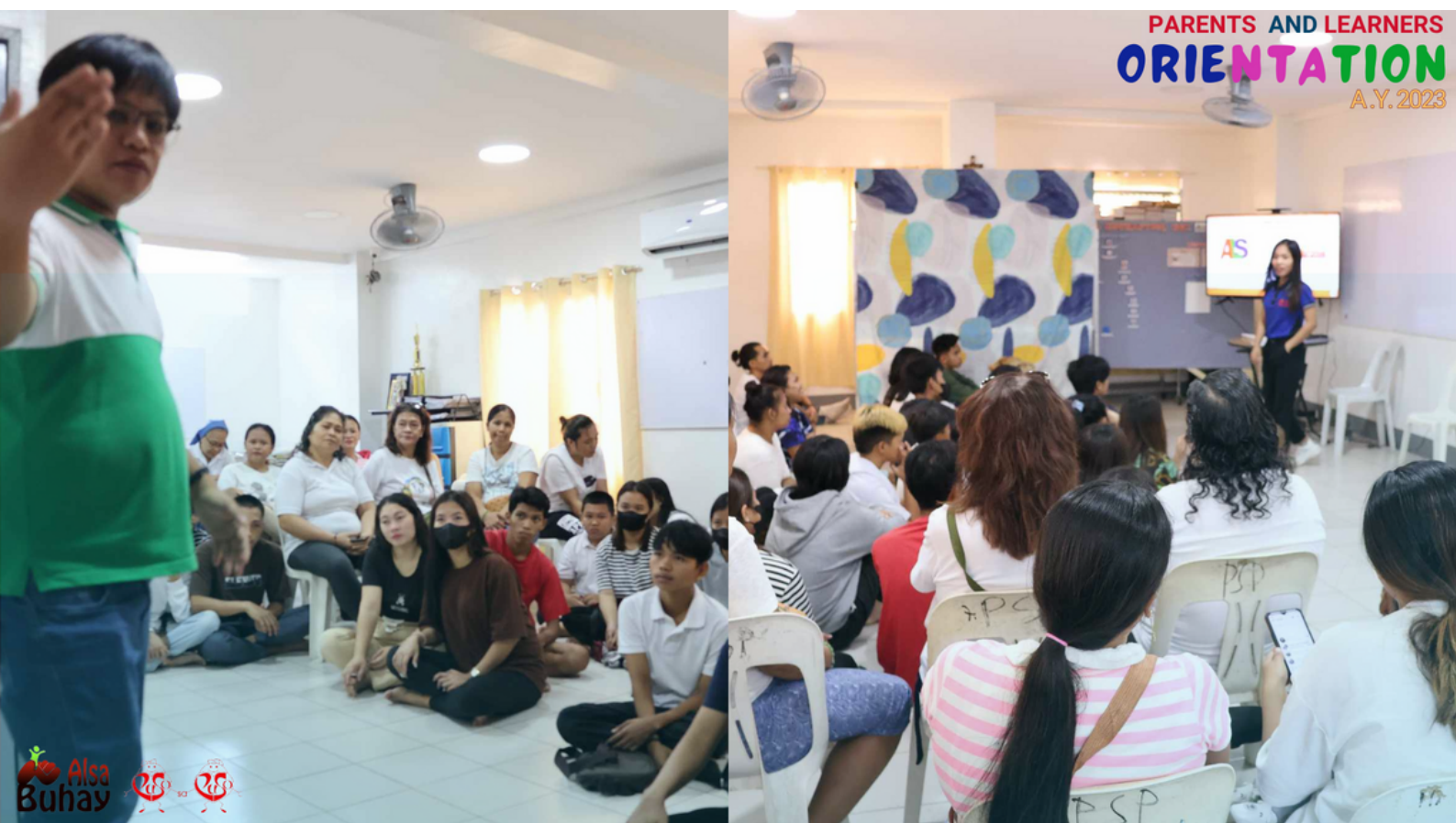
Captured during the presentation and discussion of ALSA-BUHAY program