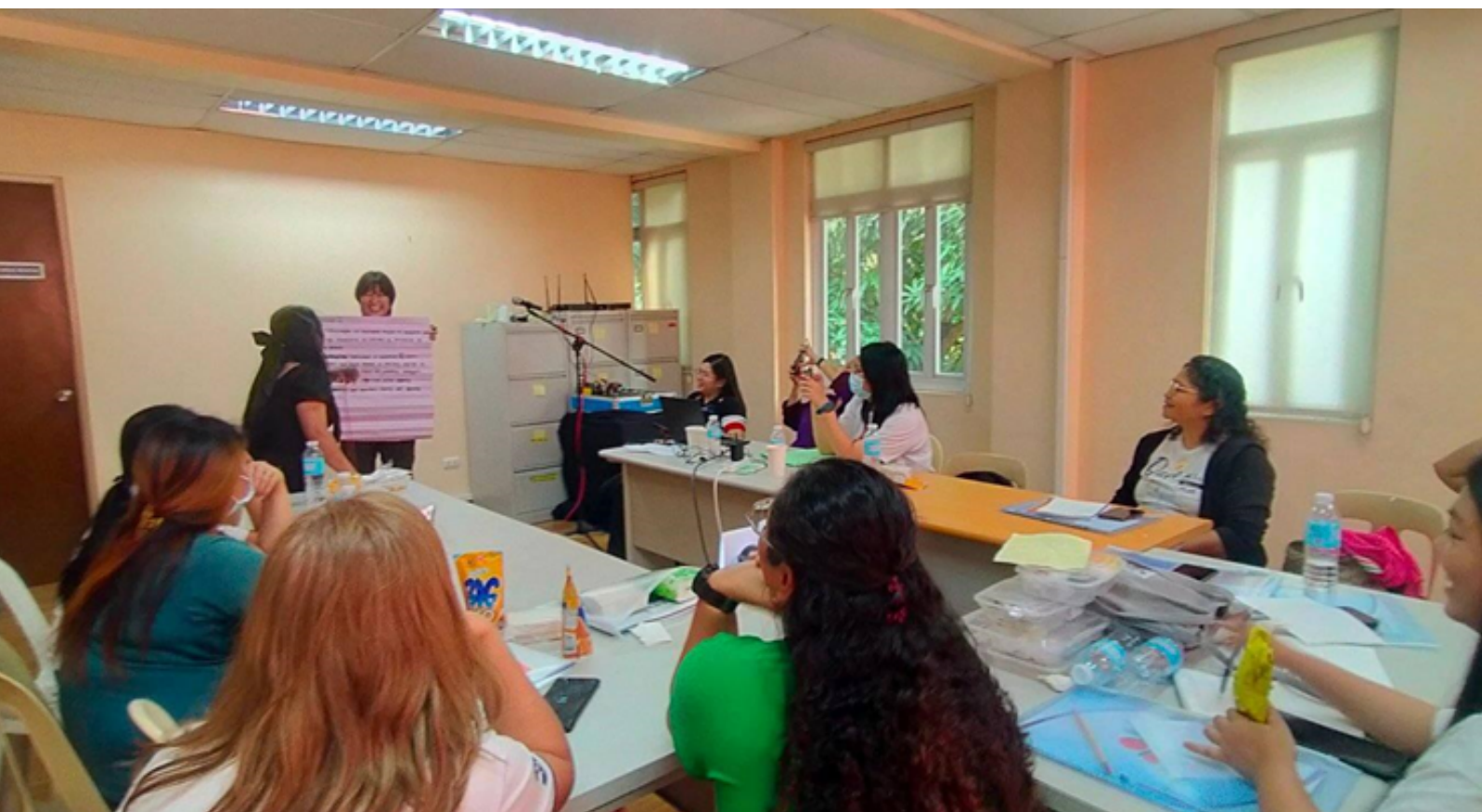
Captured during the workshop.