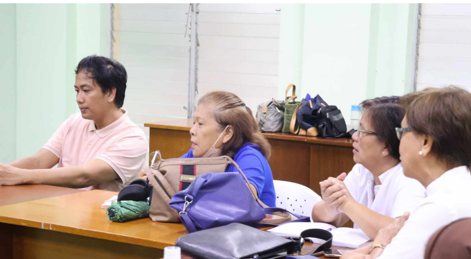
Captured during the discussion together with the Lay Salvatorian's