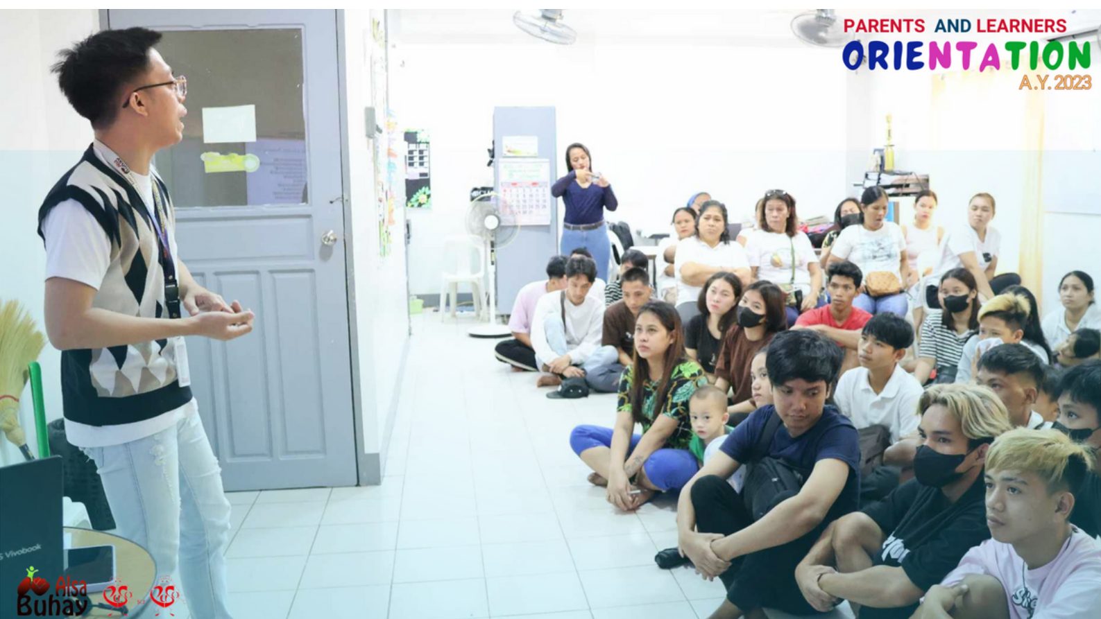
Captured during the presentation and discussion of ALSA-BUHAY program