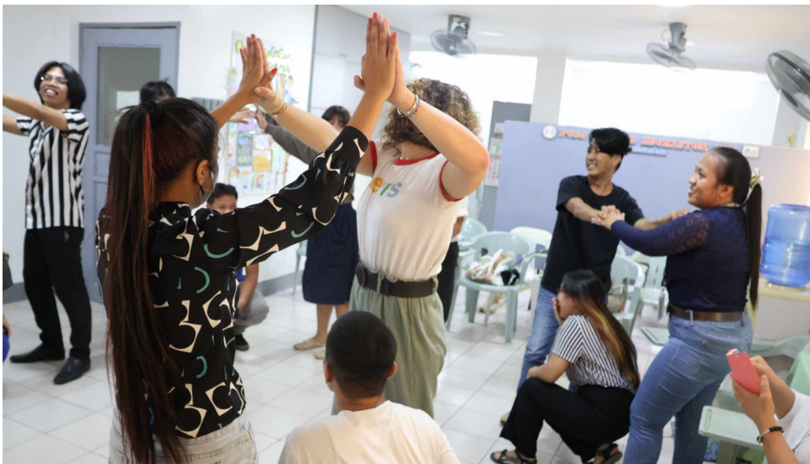
Captured during the activity