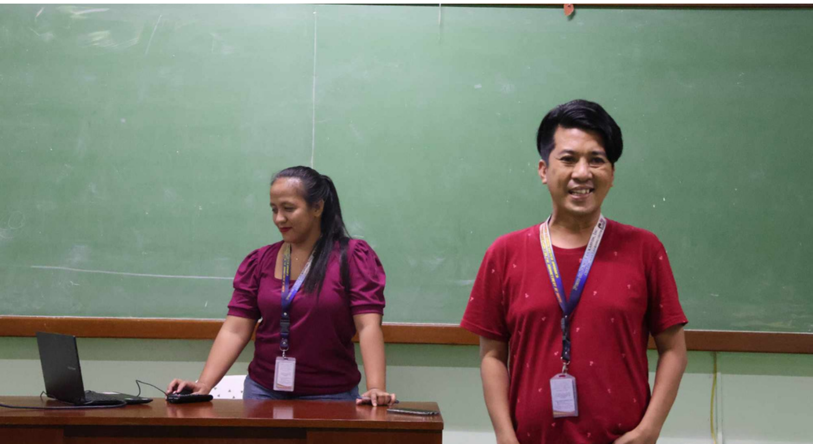
Captured during the presentation of PSPEI Staff at Talon, Cavite.