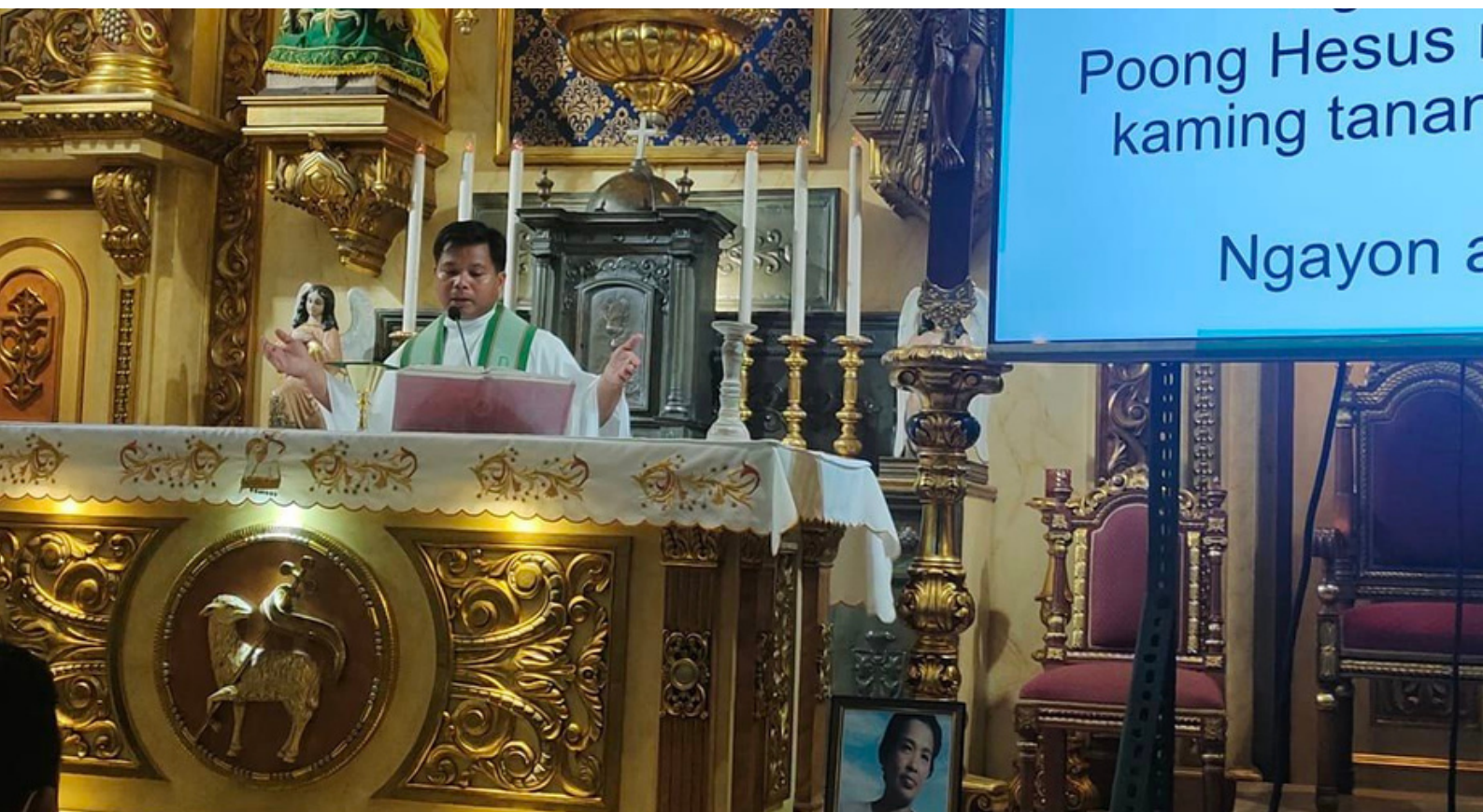
Captured during the mass.