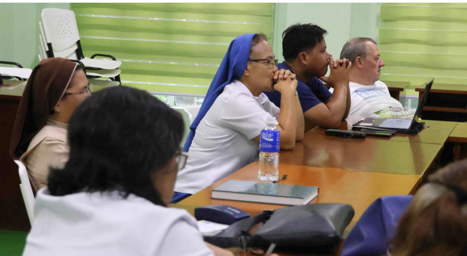
Captured during the presentation of PSPEI Staff at Talon, Cavite.