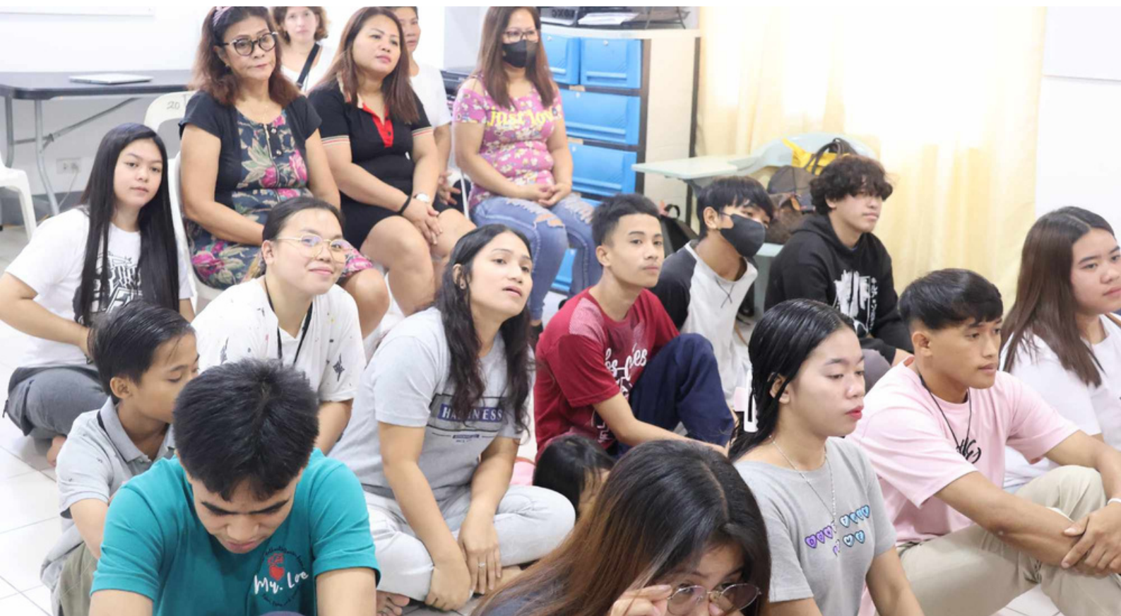
Captured during the Holy Mass