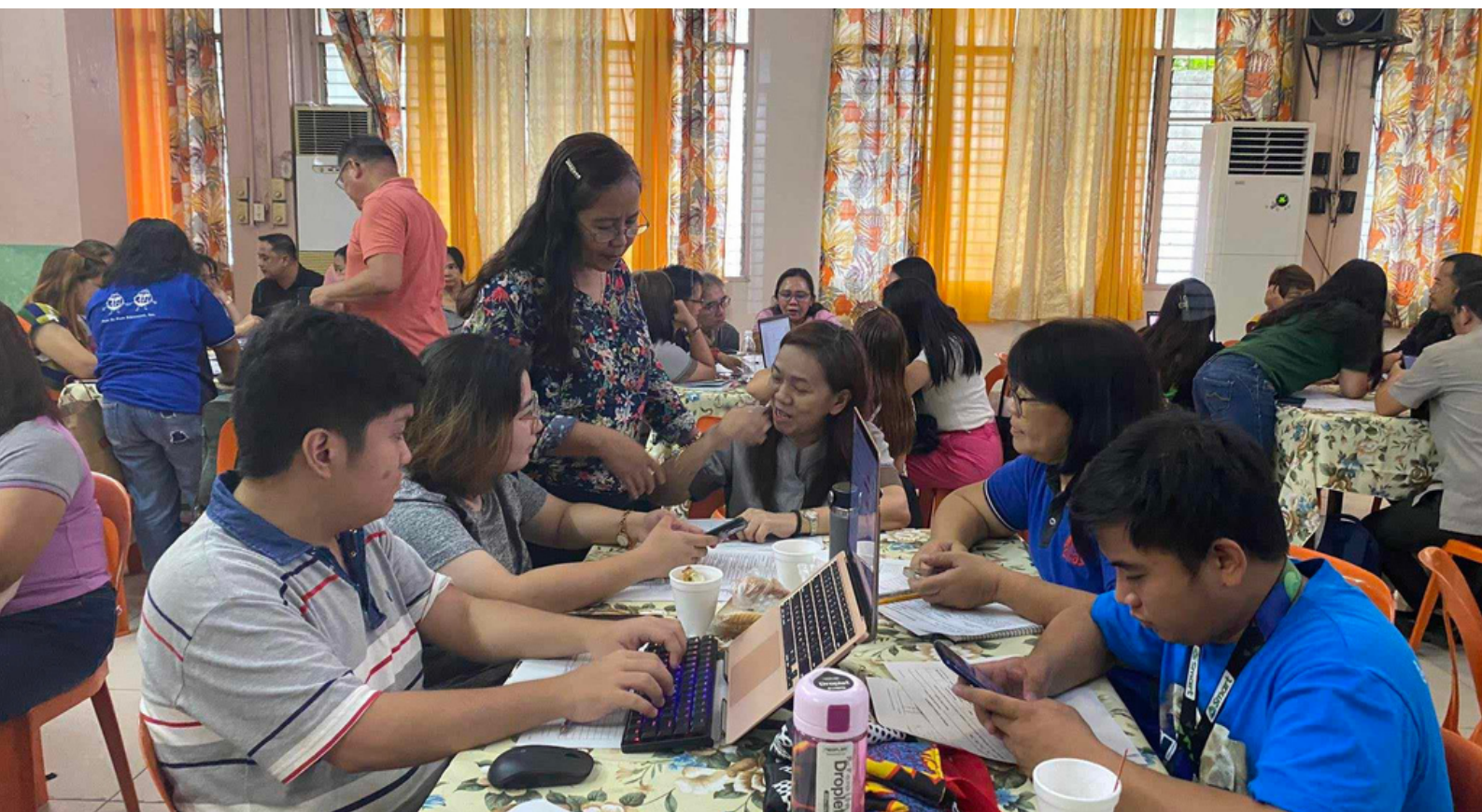
Captured during the workshop together with the other NGO's teachers.