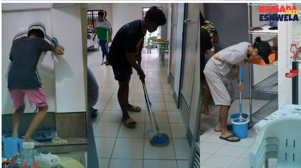
Captured during the cleaning and sanitizing the facilities