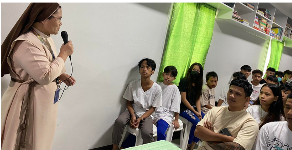
Captured during the orientation of learners and parents