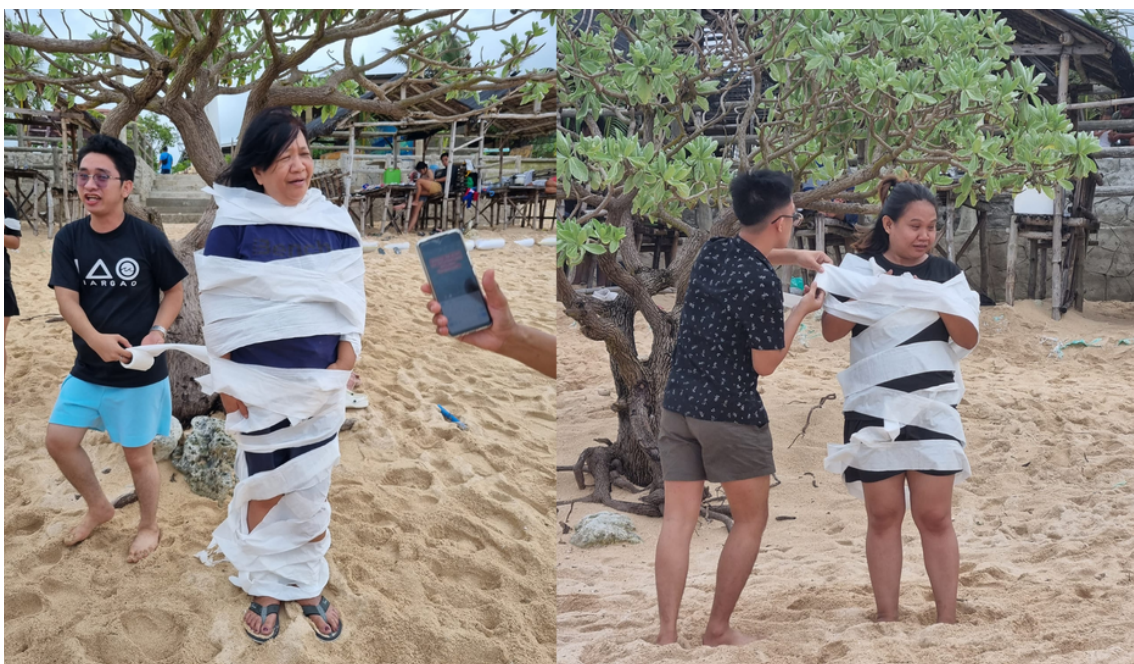
Captured during the activities in Patar, Beach