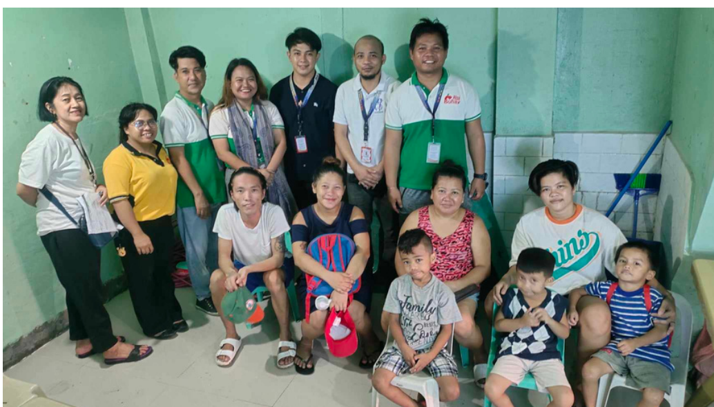
Captured during and after the Orientation.