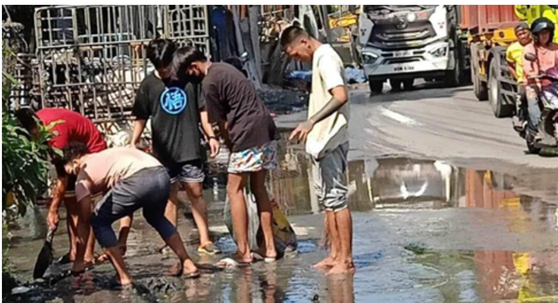
Captured during the cleaning and sanitizing the facilities